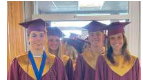
ONWARD, FORWARD NHS GRADS CLIPPER PRIDE