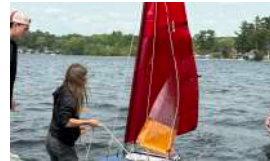
BUILDING SAILING ROBOTS INNOVATION