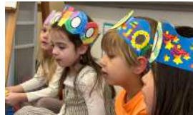
CELEBRATING THE 100TH DAY TRADITION