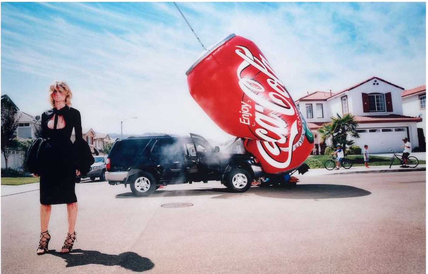
Photographer: David LaChapelle Title: Inflatables: Coke Can Date: 2002 Price (Per Print): £9,600

Image Analysis: Answer the questions in as much detail as possible.