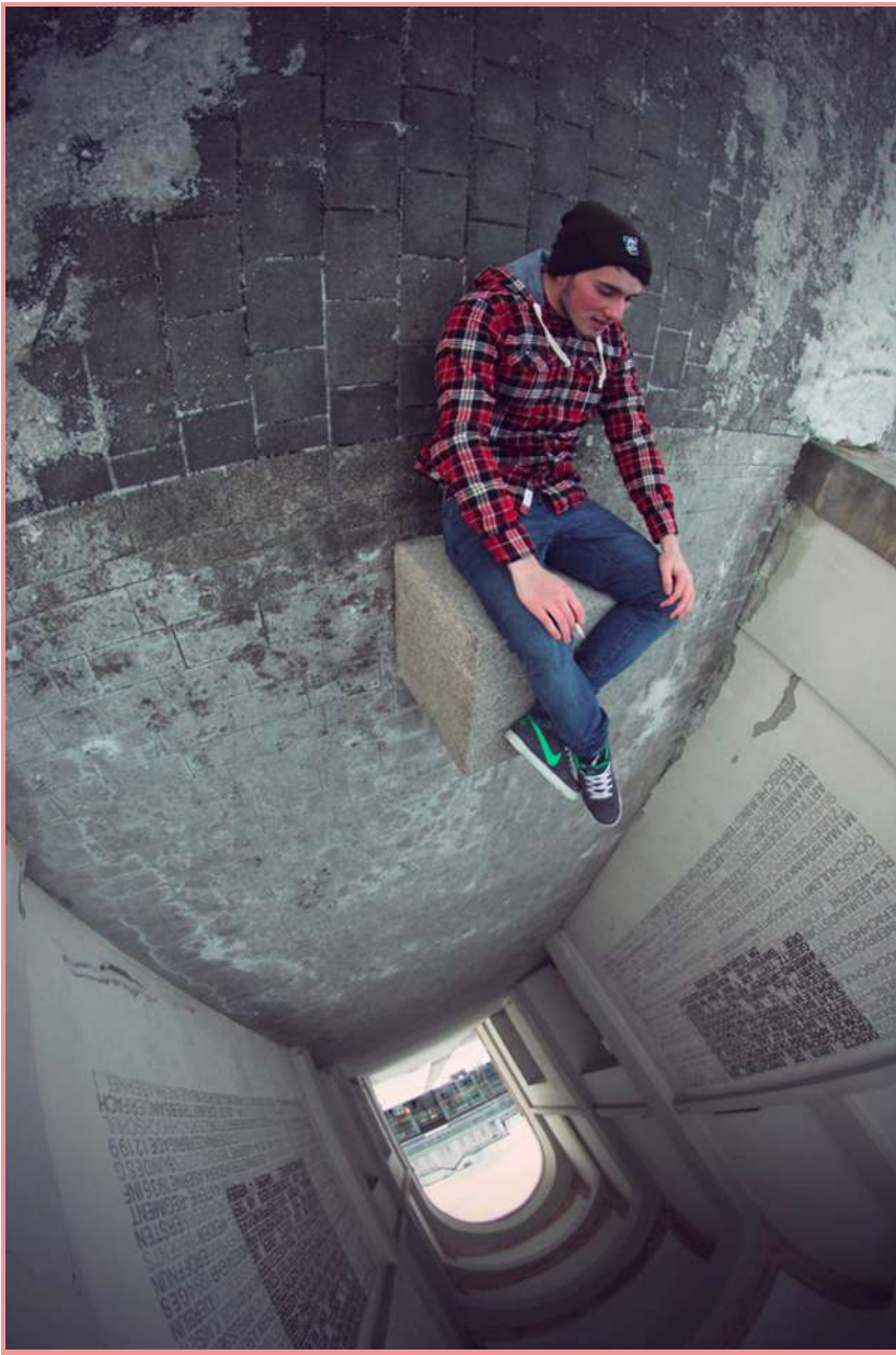
Title: Point of View Date: 2012

Image Analysis: Answer the questions in as much detail as possible.