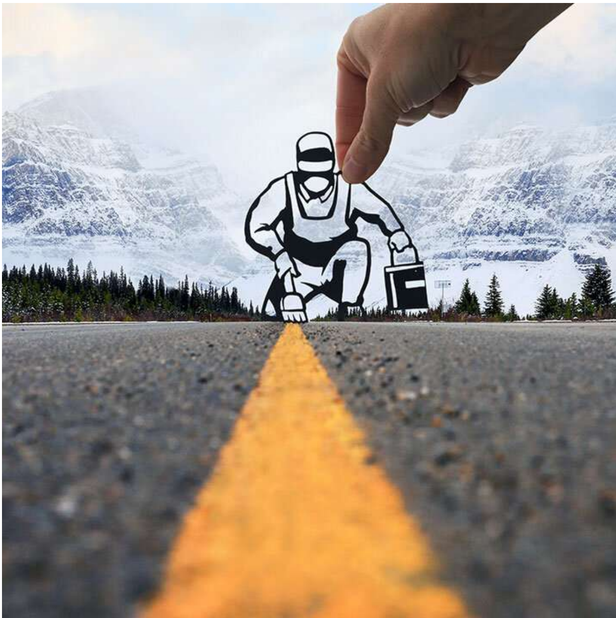
Title: Painter Date: 2020

Image Analysis: Answer the questions in as much detail as possible.