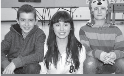
JMS students dominate at Japanese Speech Contest, see page 2