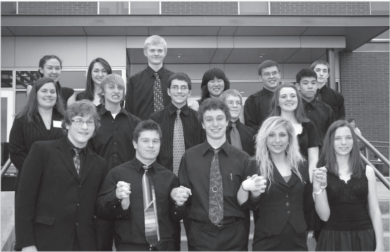
Members of the WHS band.

The WHS Wind Ensemble performed at the Lower Columbia River Band festival at Mountain View High School. The band placed 2nd out of 15 Clark County High