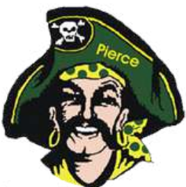
Pierce Middle School