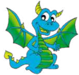
Donelson Hills Elementary