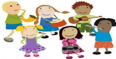
Musical Kids EPS PNG JPEG