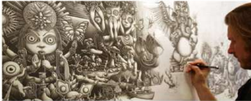
Example of Dil Se Desi drawing

You need to be in the photograph showing your face or partial profile with your project