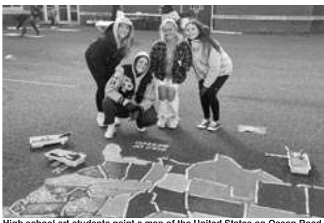
High school art students paint a map of the United States on Ocean Road

amazing things we can accomplish when we work together as a school community!"