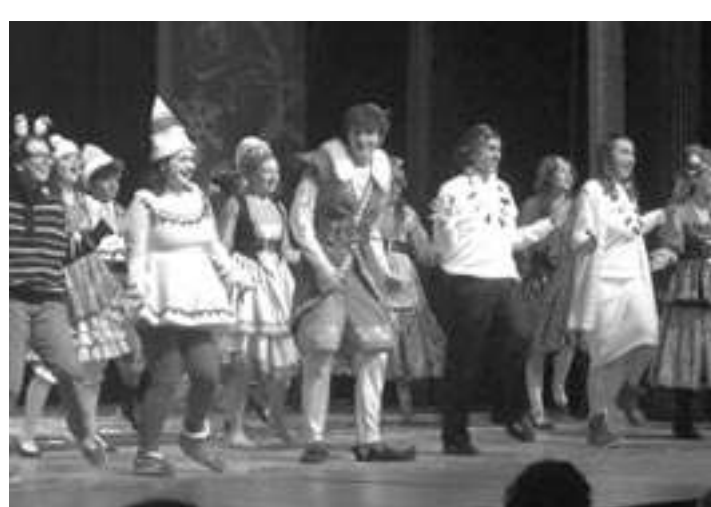
The cast of Point Pleasant High School's fall production, Elf the Musical!

The cast and crew put a lot of work into a full-