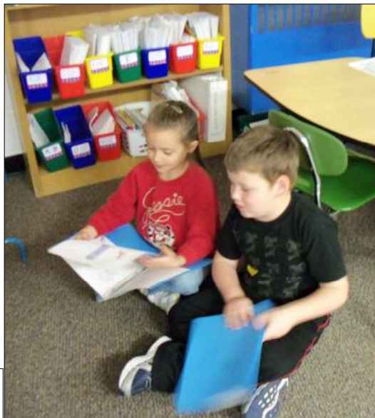
First Graders Share Their Writing

Valentine's Day will bring an emphasis on friendship and kindness to our classmates. President's Day will shift our focus to our current and past presidents. We will learn about the duties of the president as well as some interesting facts about presidential families and their time in the White House. First graders are also continuing to work hard practicing their reading, writing, and math skills.