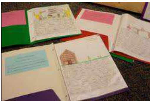
Mrs. Goedken's class' published books.

"Work on Writing" is another component of The Daily 5. This is time given to students to work on writing topics and styles that really interest them. Students' work during Work on Writing may include cards & notes to friends, lists, comic strip creation, or small moments stories -- true stories about their lives. 2nd Graders may work independently or with peers. The writing may be informal and finished in one day or be a story published and available for reading in the classroom library.