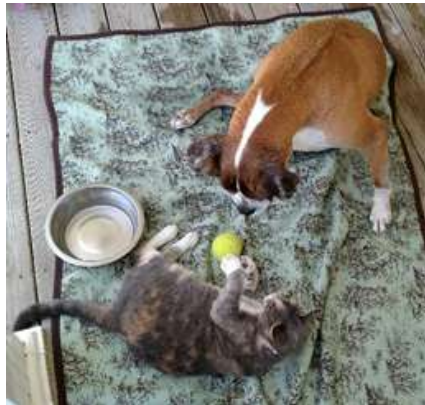
My cat(Dita) & dog(Rogue)