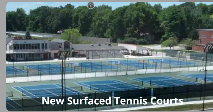
New Surfaced Tennis Courts