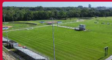
New Soccer Press Box