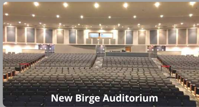
New Birge Auditorium