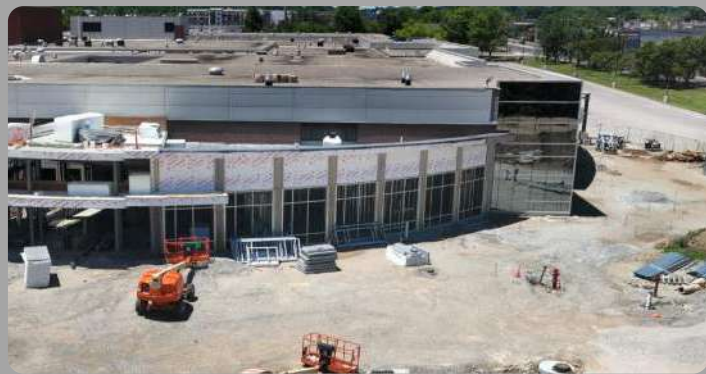
New NCHS Main Entrance

As with every phase of our projects, the design process for the Football Stadium involved careful scrutiny of the scope and related costs to ensure accountability to the taxpayers of our community. Due to budget constraints caused by the impact of inflation on construction costs, the significant reduction of renovation work for our visiting team facilities had to be reduced to remain within budget. The expanded scope will be considered for future public and private sector funding.