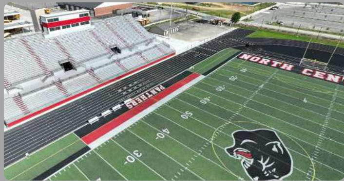
NCHS Stadium Home Side

Over the last two years, we have made significant progress on the renovation projects at North Central. We have completed a full renovation of the auditorium, constructed the Paul Logan Fieldhouse, upgraded classrooms, and enhanced site safety and circulation around the campus. Additionally, we have completed the construction of a new soccer press box and installed new field lighting and scoreboards. Substantial improvements have also been made to the Football Stadium, including new handicap accessible bleachers, a new press box, updated lighting, a new scoreboard, and a new building featuring visitor restrooms and concessions.