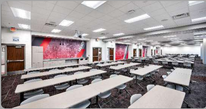
Paul Logan Fieldhouse Community Rooms

Over the last two years, we have made significant progress on the renovation projects at North Central. We have completed a full renovation of the auditorium, constructed the Paul Logan Fieldhouse, upgraded classrooms, and enhanced site safety and circulation around the campus. Additionally, we have completed the construction of a new soccer press box and installed new field lighting and scoreboards. Substantial improvements have also been made to the Football Stadium, including new handicap accessible bleachers, a new press box, updated lighting, a new scoreboard, and a new building featuring visitor restrooms and concessions.