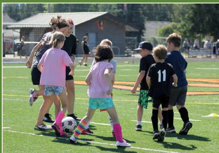
In partnership with the Panther Foundation, Washougal School District hosted summer sports camps to prepare students for the fall athletics season and develop teamwork skills.