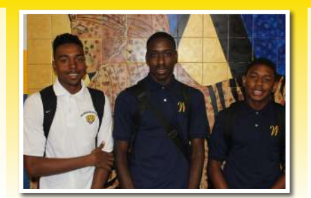
The Power Wednesday Program provides academic intervention and support for EVERY High School student

Students at WHHS will be participating in a new academic intervention program beginning on October 27th. The Power Wednesday Program will provide intervention support to all students every Wednesday through the end of the school year. Students will have the opportunity to select a morning or afternoon session based on their daily class schedule. The new program was developed specifically for the High School to address the fact that not all students took advantage of existing optional intervention programs. All content area teachers will provide intervention sessions in the four main content areas of English/Language Arts, science, social studies and math. Each student will be assigned to a specific teacher based on their unique learning needs. During each session, students will complete class assignments and receive detailed, helpful feedback from the classroom teacher to help them improve their proficiency in the specific content area. In addition to this exciting new learning opportunity, students also have access to the existing 21st Century Learning Center, which provides credit recovery, tutoring and Ohio Graduation Test Preparation. The new program is one more way our students are being given the 'power' to achieve!