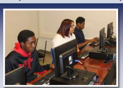
Education Quality is one of the seven categories featured in the Parent Survey

and provide feedback during late fall 2014. The Warrensville Heights City Schools wish to thank all parents and quardians for their continued support. and look forward to developing a stronger, more vibrant partnership in the near future.