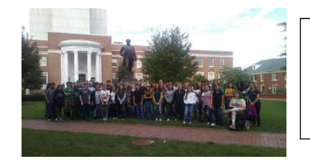
Left: More than 70 MCEC AVID students touring the campus of UNC-Greensboro.

Both East and West football teams have been off to slow starts with East sitting at 3-3 and West at 1-4. In possibly the last game between East and West Montgomery High Schools, East overtook West Montgomery 42-14. West Montgomery volleyball is nearly undefeated with a current record of 10-2, and East Montgomery has a record of 2-8. Men's soccer season is in full effect with both East and West yielding a few wins (East – 4-2-1; West – 3-4-1). Ladies' tennis at East Montgomery has a current winning record of 5-0, while West Montgomery's overall record is 1-11. The cross country teams at both East and West are doing pretty well, and Phoenix runners have placed in several events.