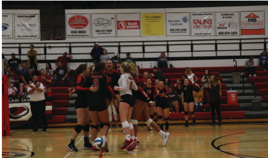
Pictured Girls' Volleyball Team