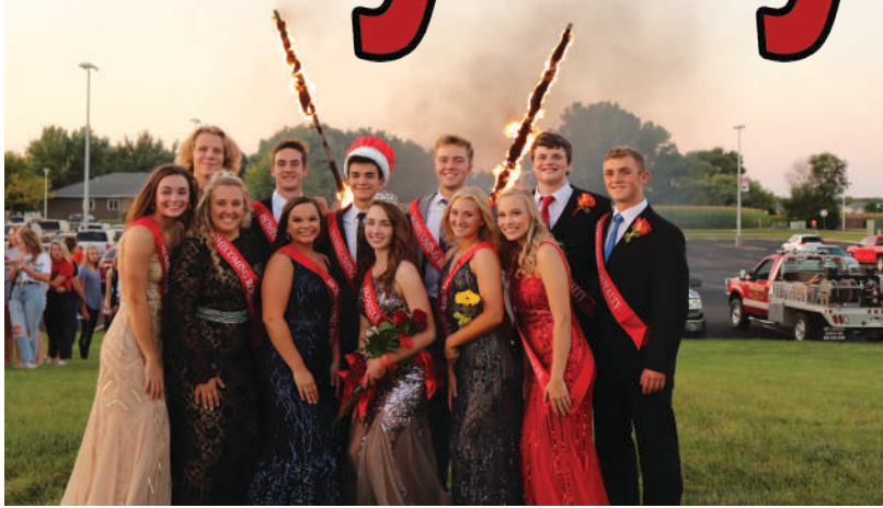
Left Photos Submitted Photo by Mya DeJong