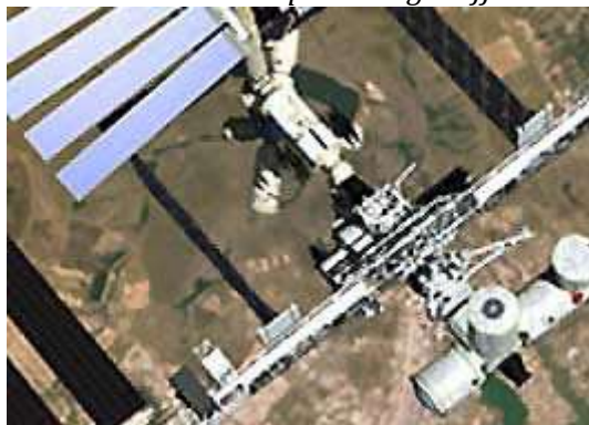
The International Space Station orbiting the Earth at a height of 218 miles

Determine the force of gravity acting on a 100 kg person standing on the surface of the Earth and in orbit aboard the International Space Station. Calculate the percentage difference.