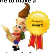
Jimmy Neutron Boy Genius