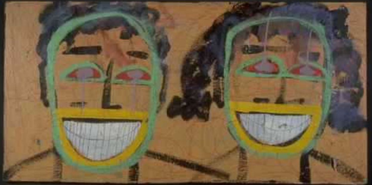
Tyree Guyton, Ups and Downs , 1994