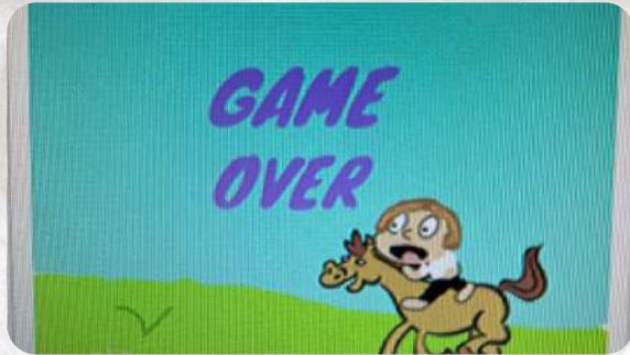
A game created by a student in period 7