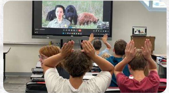
Google Meet with a park ranger from Glacier National Park