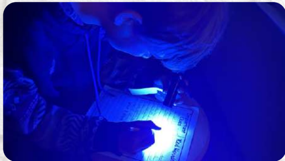
Using backlights to look for clues