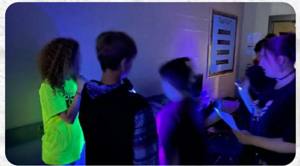
Collaborating to solve the mystery