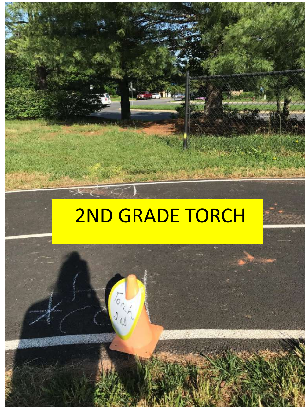
2ND GRADE TORCH