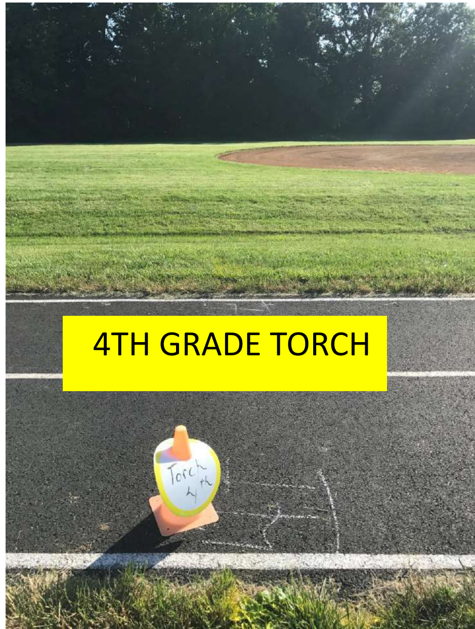
4TH GRADE TORCH