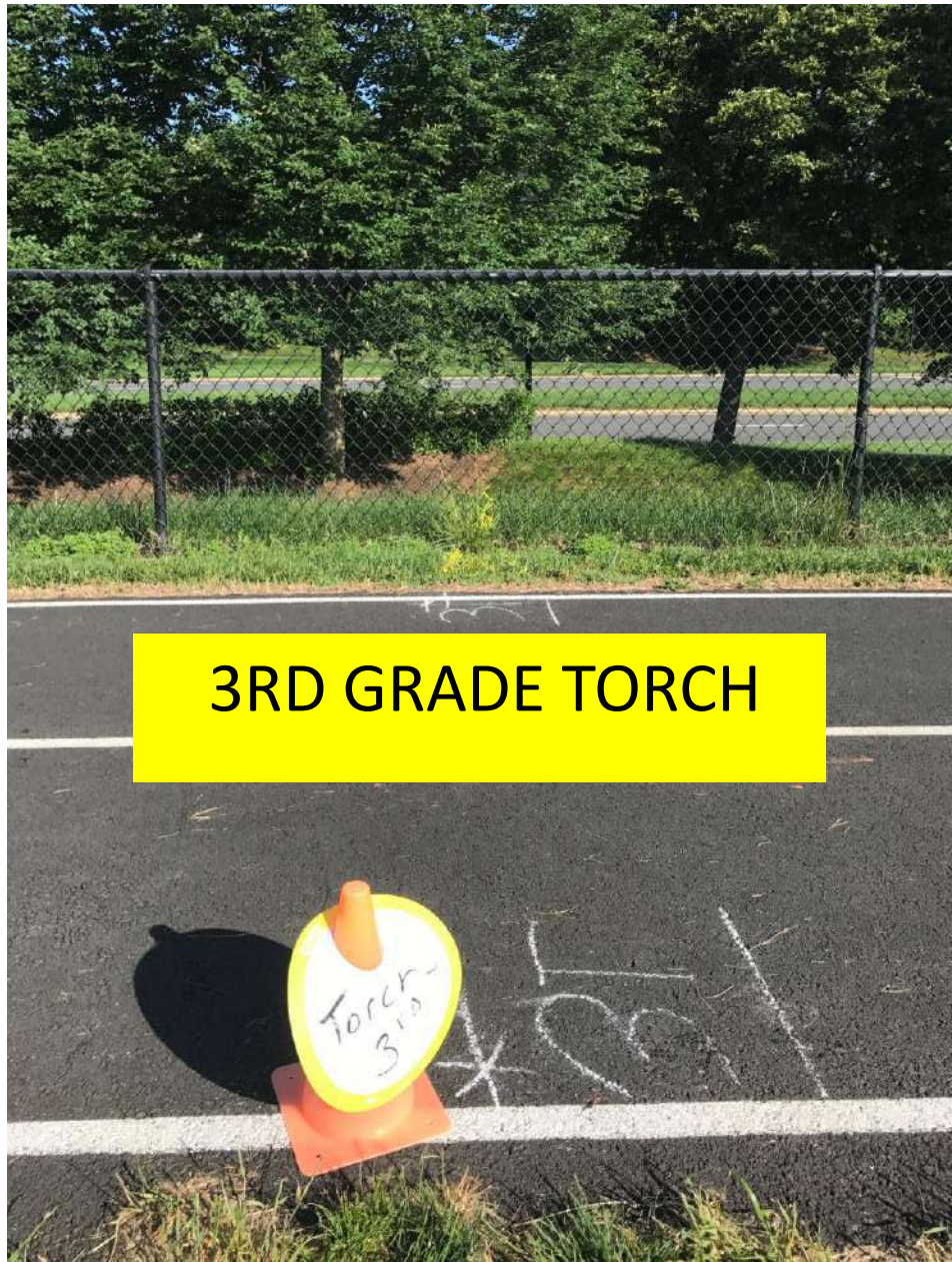
3RD GRADE TORCH