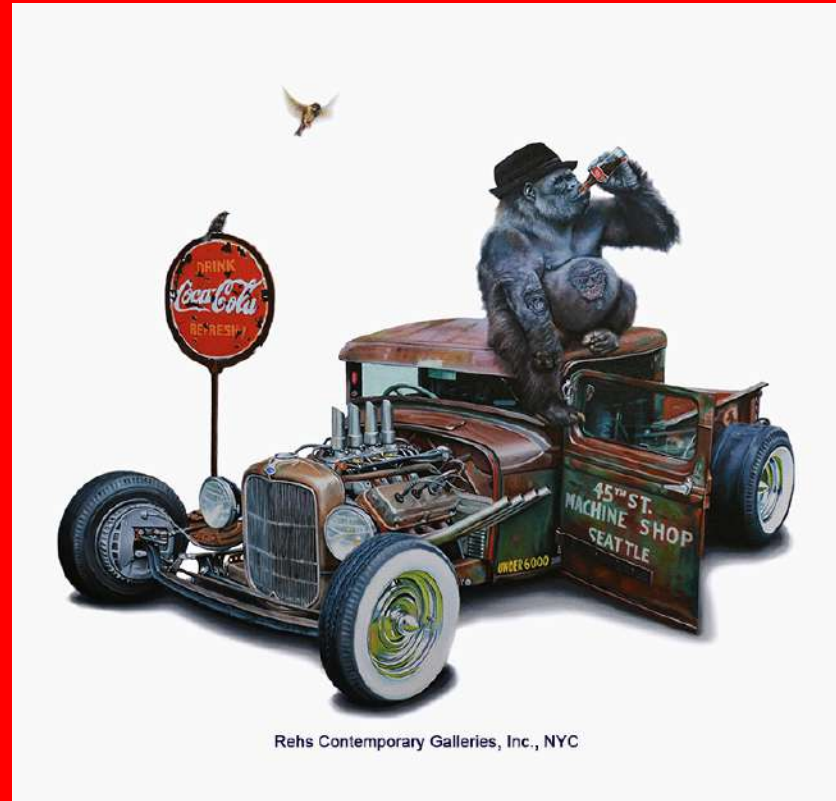
Rehs Contemporary Galleries, Inc., NYC