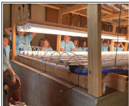
Thinking about how hydroponics allow healthy plants to be grown year round.

Our entire school spent Wednesday, April 26, teaching, learning and working together at our Butte Falls Natural Resource Center campus. During the morning our 8 th grade and high school students led our Kindergarten through 7 th grade students through activities exploring animal diversity, plant diversity, water, and the impact of plastics on our environment.