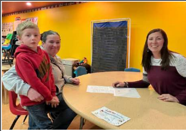
Conferences are for our younger students!

We thank all our parents and students for participating in our Spring Conferences two weeks ago. It was inspiring to see how much our students have grown since the Fall Conferences. We appreciate the opportunity to include students in the discussion of their learning and their academic and social development. Thank you, teachers, for your preparations for these important meetings.