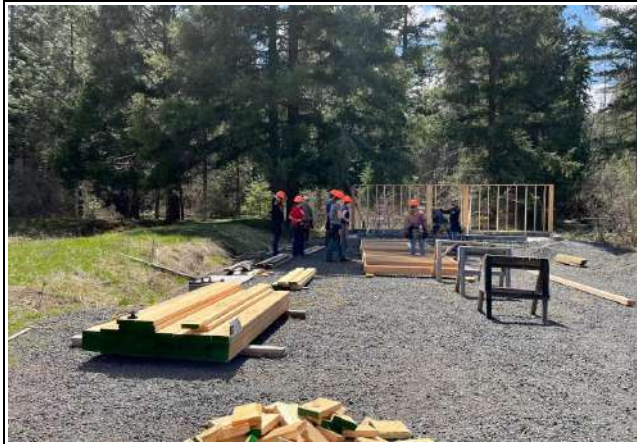
Assigning work teams for the day. Communication, Cooperation and Safety are job requirements.