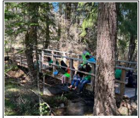
Middle Schoolers enjoy the bridge.

After a delicious picnic lunch packed in paper sacks by our nutrition services kitchen team, we posed for a school photo and acknowledged the investment by Ruby Edwards and Cecil Bailey in funding for activities like this. Their recent gift to our school is used to fund service projects by students and to encourage stewardship of our natural resources.