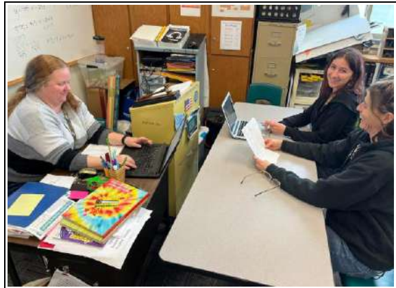
Conferences are for our soon-to-be graduates!