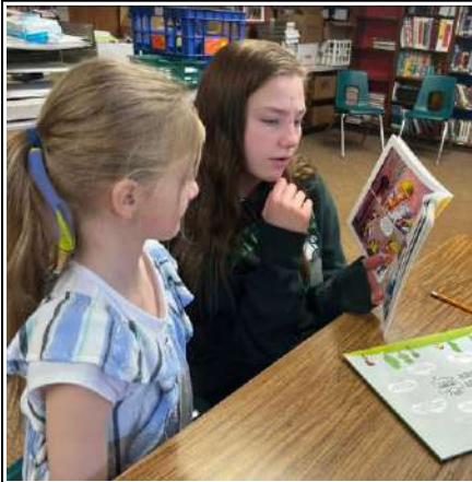
Partner reading in the Library.

We were able to restart our SMART (Start Making A Reader Today) Reading program this winter after a two year pandemic break. This year sixth and seventh graders have applied to be readers. SMART Reading provides a wide selection of grade level books. Our Kindergarten and First grade students read with their reader for 20 minutes each Wednesday afternoon. At the end of the session each student may select a book to take home for their own personal library. SMART is a state-wide non-profit organization dedicated to supporting literacy and positive relationships. You may learn more at https://smartreading.org .