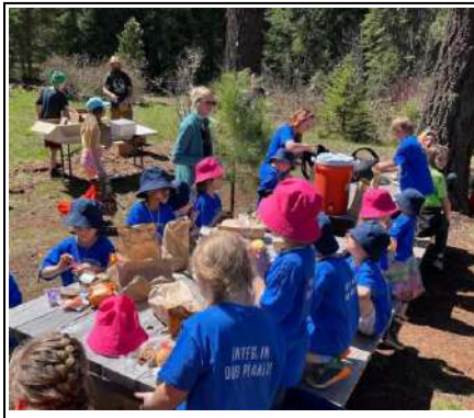
Kindergarteners refuel for more fun. .