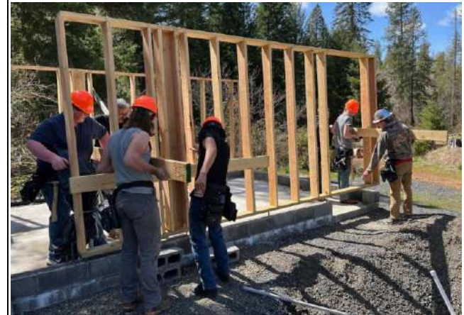
Another section of wall framing is set in place and secured. And it fits with great accuracy!