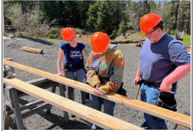
Precise measuring and cutting to meet the blueprint specifications provide the best hope for success!