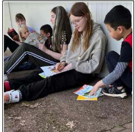
Nice weather? Let's read outside!