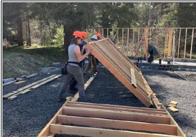
Lifting a wall is an exercise in applied physics. Many hands make work light(er)!