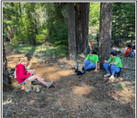
7 th grade friends take a lunch break.