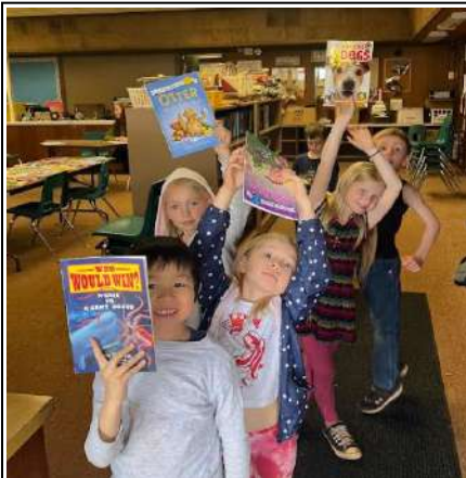
New books to take home!