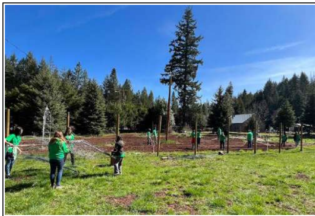
8th grade students work together to install a protective fence for newly planted fruit trees in the "Food Forest."

In the afternoon middle and high school students helped with on-site service projects in the NRC garden and around the NRC campus.