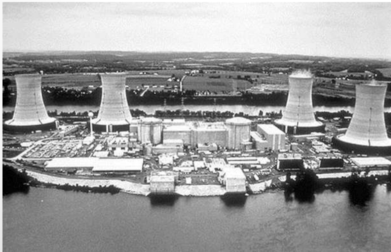
Before Accident: Three Mile Island