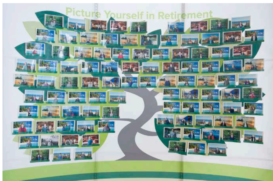
A green screen photobooth activity allowed members to “Picture Yourself in Retirement.” Research has shown that visualizing your future can have a powerful effect on saving for retirement.

The goal of Retirement Expo was to help members “retire with confidence” by giving them an opportunity to get all of their retirement resources under one roof: face-to-face interactions with OSGP and PERS counselors, PERS Health Insurance, and Social Security Administration representatives, as well as education sessions and other activities. There were nearly 5,000 total registrations for over 50 presentations that took place throughout the day. Thank you to all who attended.