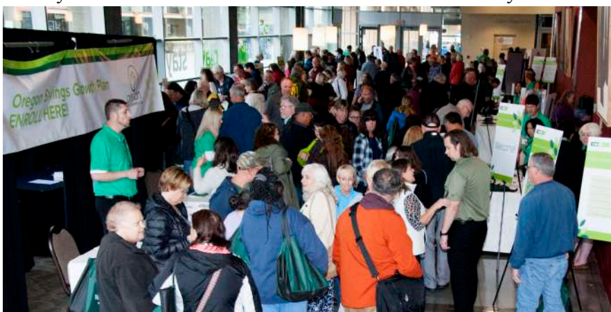
The hallways of the Salem Convention Center were packed in between education sessions. People were able to sign up for OSGP; speak with PERS, OSGP, and PERS Health Insurance counselors; and access other financial resources.

In addition, PERS and OSGP traveled across the state the following week for smaller events, giving members in Portland, Ontario, Medford, Coos Bay, La