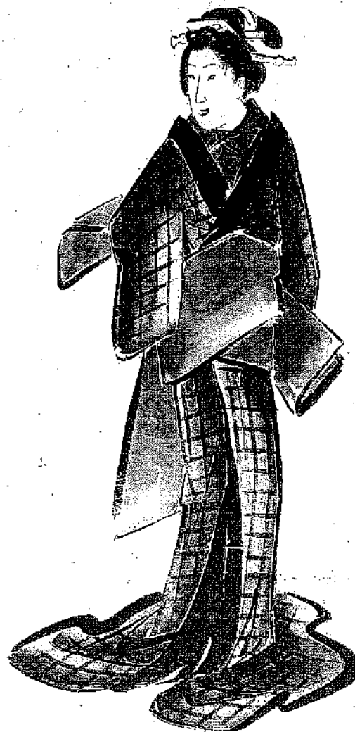
Standing Beauty , 1851. Ando Hiroshige. Hanging scroll, ink and color on paper, 91.5 x 21.7 cm. The British Museum, London.

"Do not worry, my son," she answered gently. "I am just marking the way so you will not get lost returning to the village."