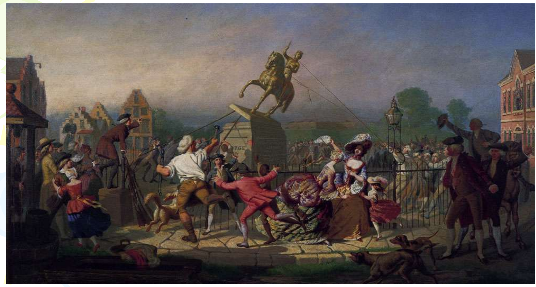
Lafayette College Art Collection

The American colonists' desire to assert their liberties led, in time, to a deep hostility toward British government, as when these New Yorkers toppled a statue of King George III, melted it down, and used the metal to make bullets.