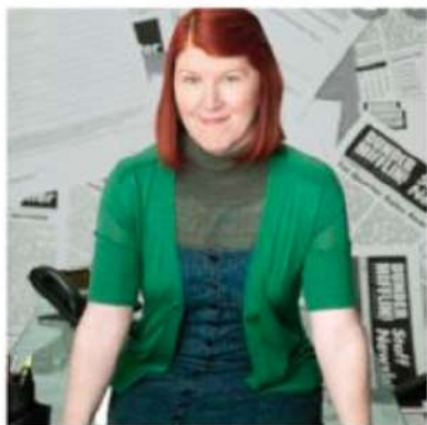
Meredith Palmer Fire Girl