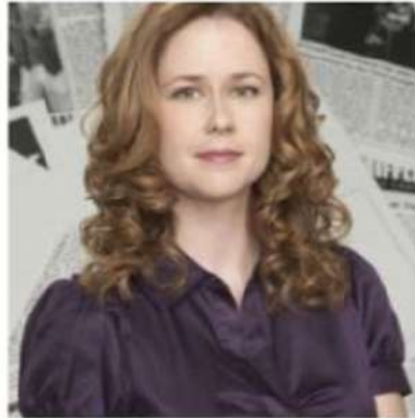
Pam Beesly/ Halpert

Beesly Pammy Pamalamadingdong Pamcaso Pamcakes Pam Pam Pamster Pam Chops