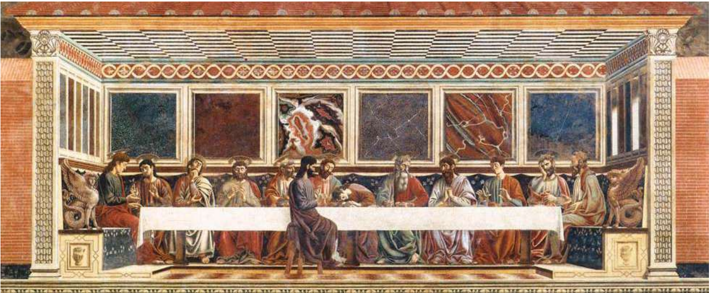
Andrea del Castagno's Last Supper, in a former convent refectory that is now a museum.