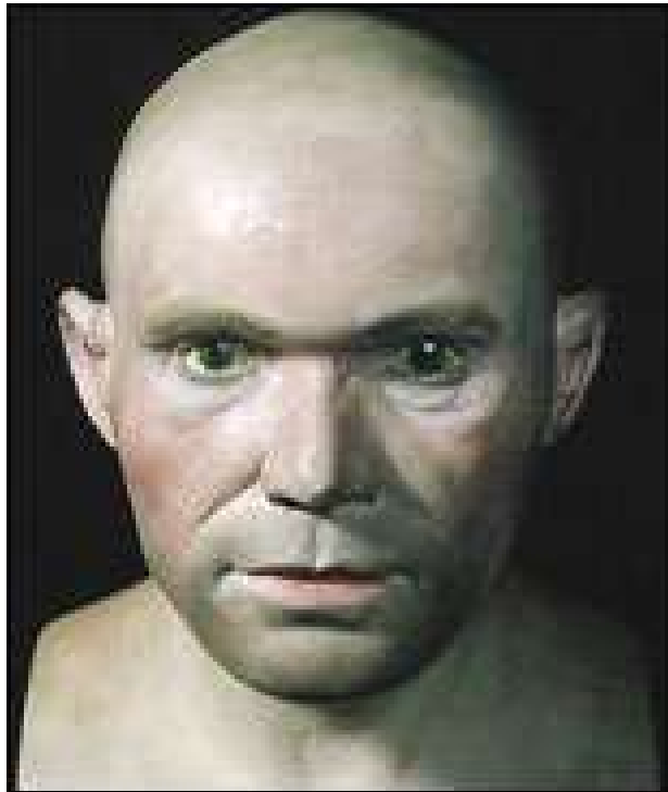
The Natural History Museum