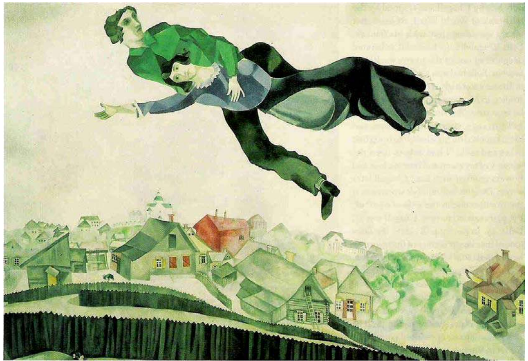
Chagall and Bella, his partner and muse for 30 years, float magically over their hometown of Vitebsk in Above the Town , 1914-18.

Returning to Vitebsk in 1914 with the intention of staying only briefly, Chagall was trapped by the outbreak of World War I. At least that meant spending time with his fiancée, Bella Rosenfeld, the beautiful, cultivated daughter of one of the town's wealthiest families. Bella had won a gold medal as one of Russia's top high-school students, had studied in Moscow and had ambitions to be an actress. But she had fallen for Chagall's strange, almond-shaped eyes and often knocked on his window to bring him cakes and milk. "I had only to open the window of my room and blue air, love and flowers entered with her," Chagall later wrote. Despite her family's worries that she would starve as the wife of an artist, the pair married in 1915; Chagall was 28, Bella, 23. In his 1914-18 Above the Town (one of his many paintings of flying lovers), he and Bella soar blissfully above Vitebsk.