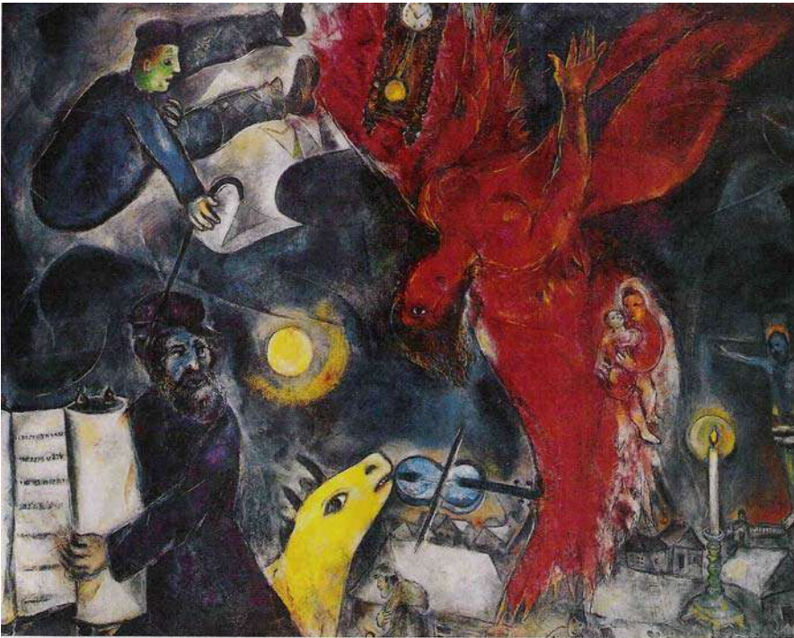
Symbols from Chagall's deeply religious upbringing in Russia are found throughout his work, as in The Fall of the Angel (above), which he worked on from 1923 to 1947. His Sketch for the Harlequin (top), a paper-and-fabric collage, dates from 1968-70.