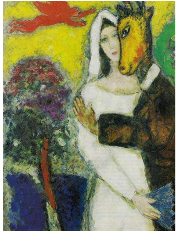
His lyrical Midsummer Night's Dream , from 1939, plays on the theme of Beauty and the Beast.