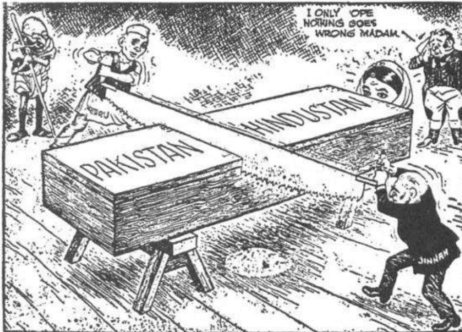
"Sawing through a woman", Pioneer July 8, 1947.