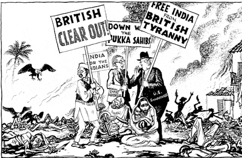
Cartoonist Leslie Illingworth's

15. What happened to Lahore after partition?