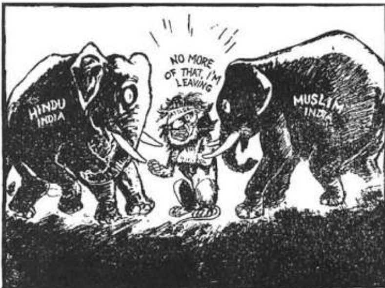
Fig. 13. "Fulfilment of a Mission?", Pioneer , 13 July 1947.