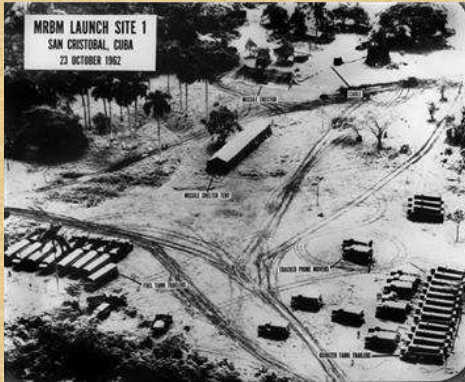
The launch sites for the nuclear missile silos