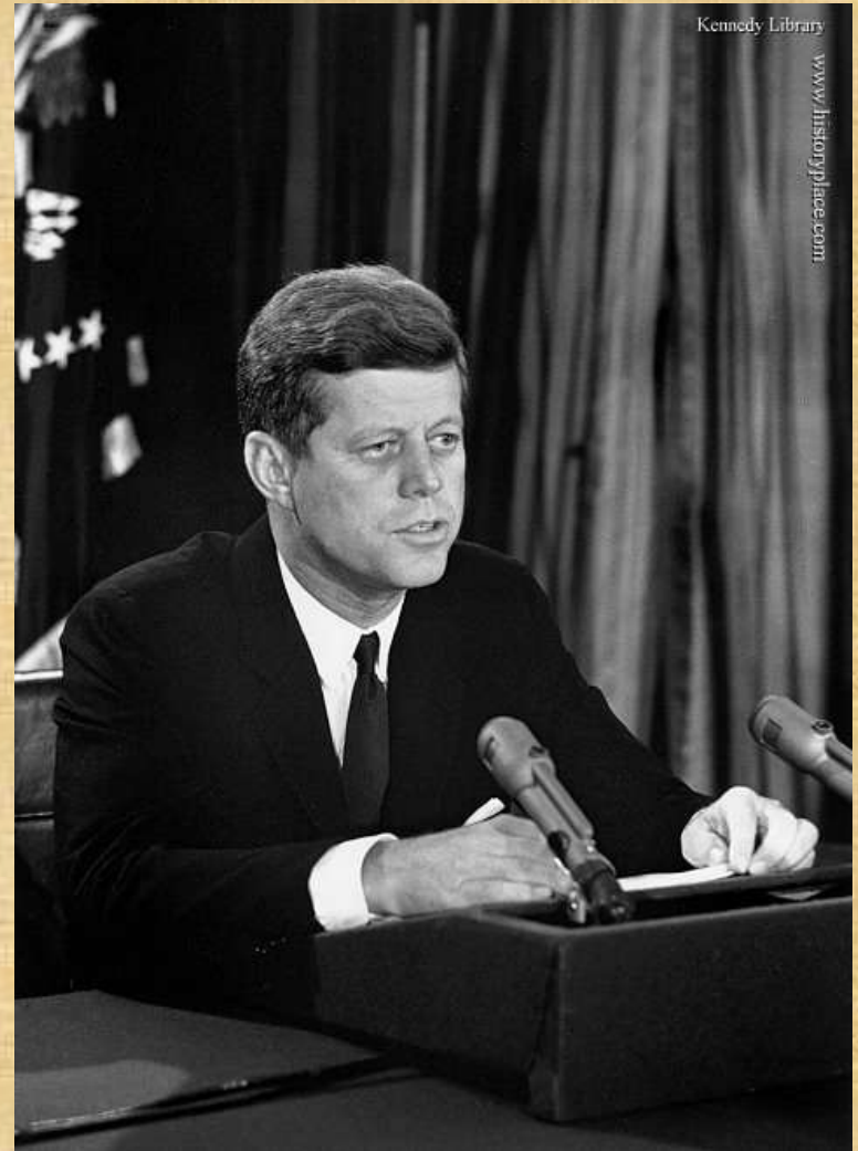
President John F. Kennedy