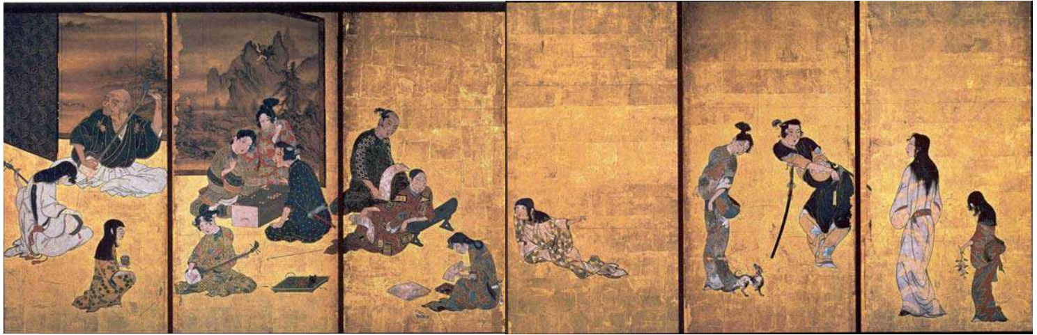
A mysterious, somewhat melancholy quality pervades the six-panel, gold-leaf Hikone Screen (c. 1620s-40s), a Japanese National Treasure and one of the highlights of the show. Although the demimonde figures in this "pleasure depiction" tableau are arrayed against a background nearly devoid of setting, their clothes and poses suggest a bordello scene.

extant is Edo," says Singer. In a sense America's distance from Japan made the National Gallery project feasible, even though there is an inevitable sacrifice of historical detail in presenting Japanese culture to a foreign public. Another problem is the justifiable reluctance of Japanese lenders to part with irreplaceable objects.