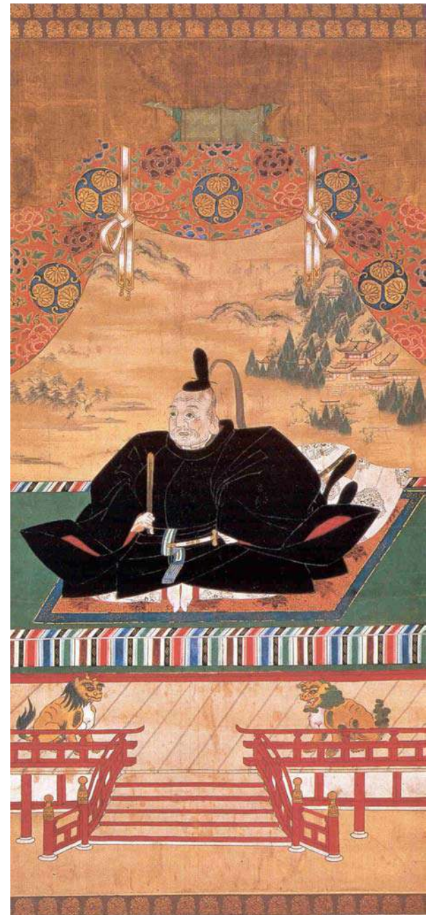
University Museum, faculty of letters, Kyoto University Tokugawa Ieyasu appears as a Buddhist-Shinto deity in this 17th-century scroll.

No survey exhibition of Edo culture has ever been attempted in Japan. The two-and-a-half-century timespan is considered too long, the fund of significant artifacts, unmanageably large. "Probably 98 percent of the historic Japanese art still