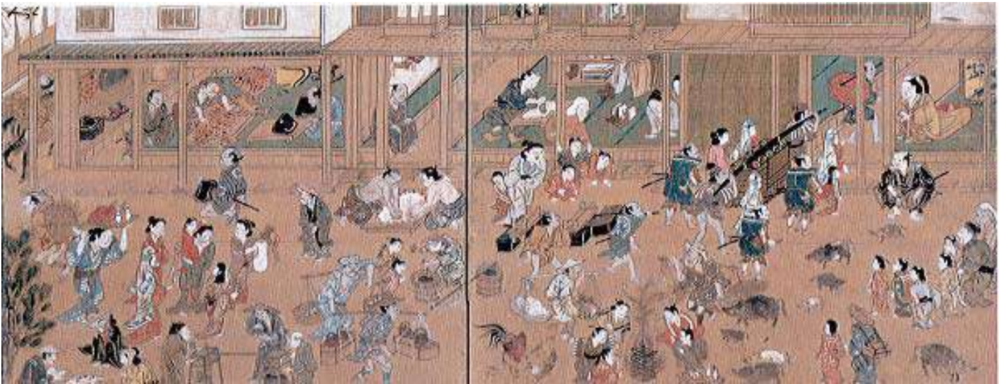
The diversity of urban life and work are elaborately portrayed in this detail from a pair of mid-18th-century screens titled Occupations and Activities of Each Month .

The world evoked in "Edo" is remote from ours in language, history, institutions and beliefs. Yet through the art assembled here we can recognize in that world early stirrings of modern life: different strata of society mixing as never before; newly centralized political power; business gaining in prestige and social impact; the reorientation of the whole society toward its cities; and good design filtering into every level of material culture, not just the elite.