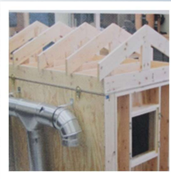
Roof Framing Module