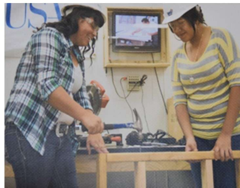
Wall Framing Module