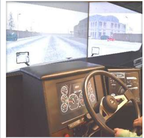
Semi-Truck Driving Simulator

https://coquille.cloud.talentedk12.com/hire/index.aspx