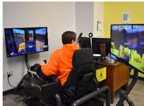
Heavy Equipment Simulators