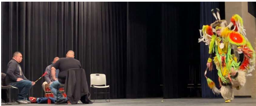
Above: Members of the Rosebud Tribe brought their talents to VHS on January 25th.

I am looking forward to seeing you on Wednesday afternoon.