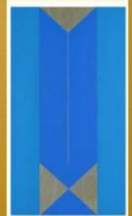
Lam Alef – contemporary