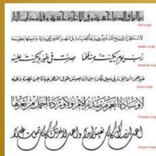
Classic Arabic scripts Naskh, Riqa, Thuluth, Duwani

This links with great expressions to great traditions of Islamic art - became known for its different expressions in ceramics, textiles, metal works and calligraphy (Lewis, 2014). Different interpretations about how Islamic artisans use the circle in their design. The circle could be used as visual representation of the unity in Islam, or could be as a symbol of a religion that highlights one God and the role of Mecca (Saeed, 2015).