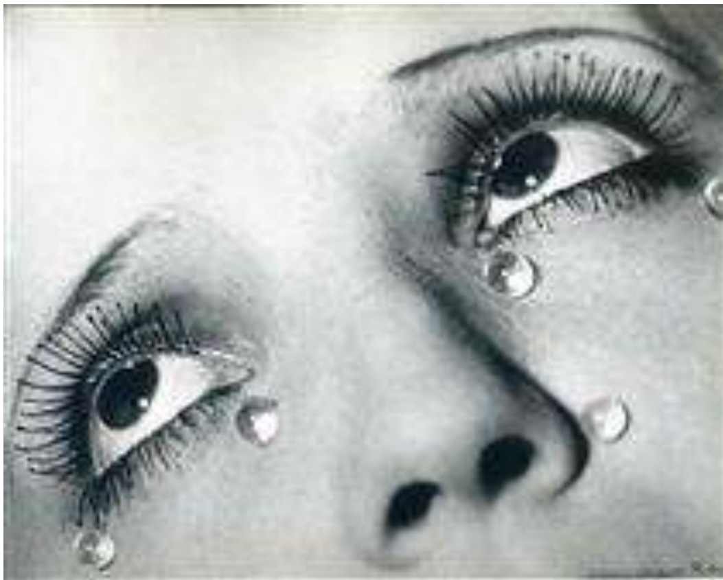
Man Ray Glass Tears 1932