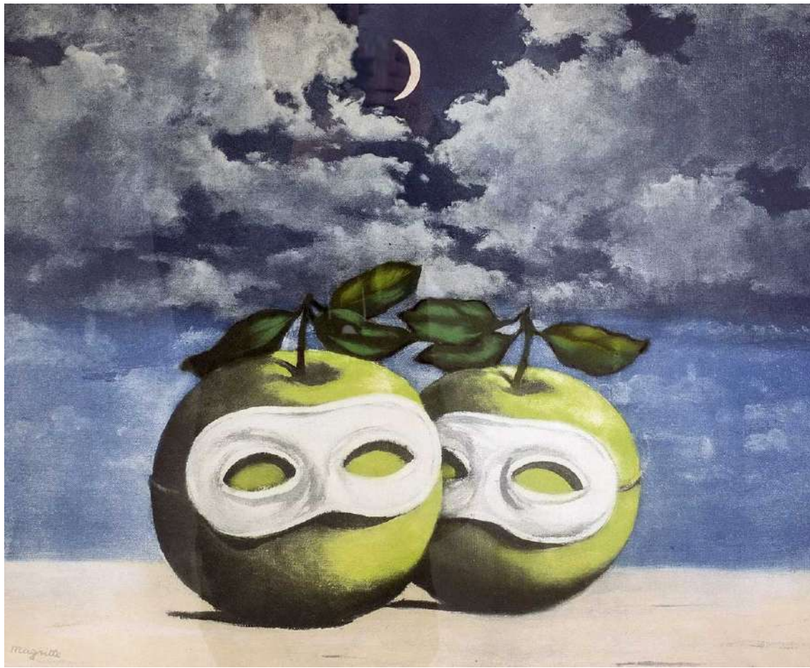
Rene Magritte "LA VALSE HESITATION 1968"