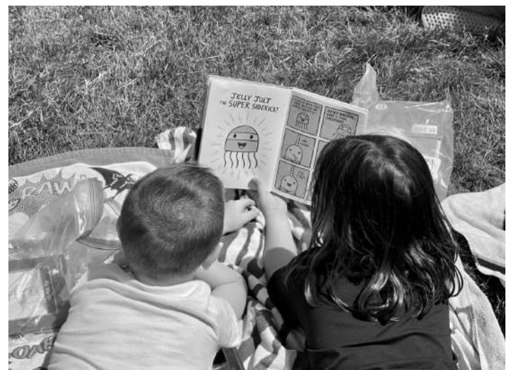
Nellie Bennett students and staff kicked off the Summer Reading Program with "Beach Towel and a Book Day!"

book they read on reading logs available on the district's Summer Reading Program webpage. Every participant who submits a completed reading log will be entered into a prize drawing at the start of the school year. Two winners from each grade level will be selected via random drawing, and one participant from each school will be randomly chosen for the grand prize.