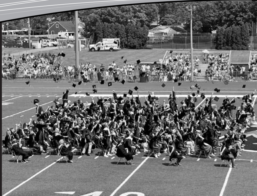
Congratulations to the Point Pleasant Borough High School Class of 2024!