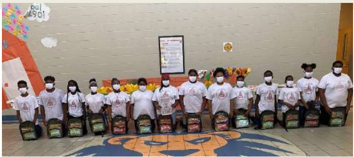
Students received backpacks filled with items from Teacher Created Materials