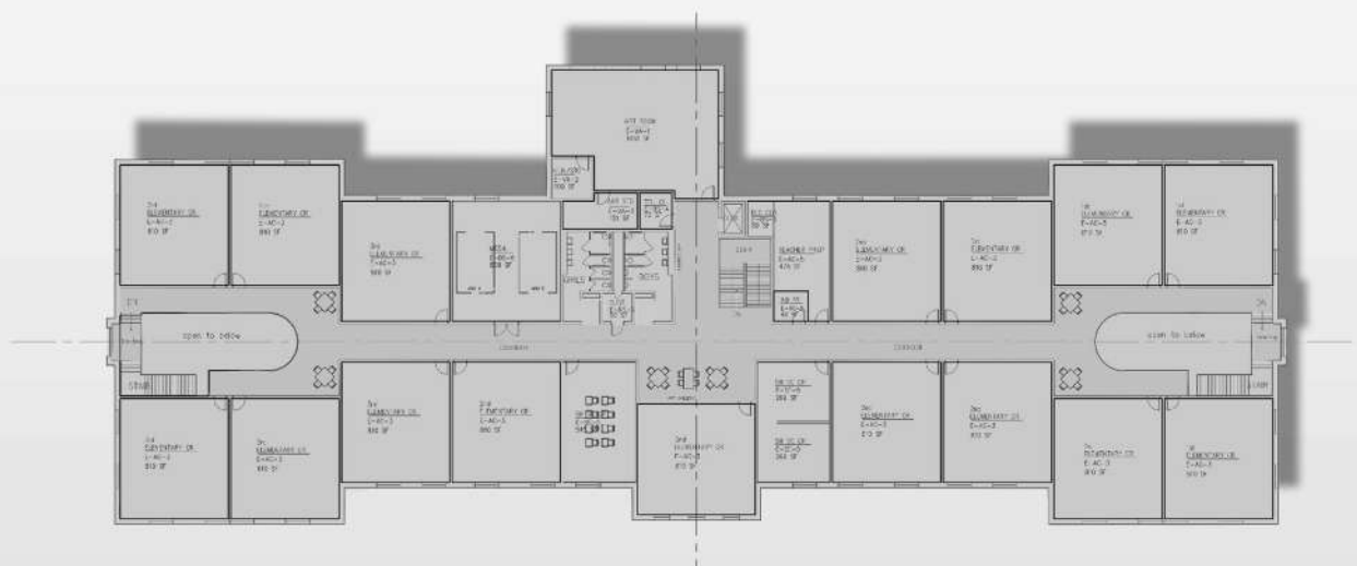
North ES Second Floor Plan Facility Master Plan