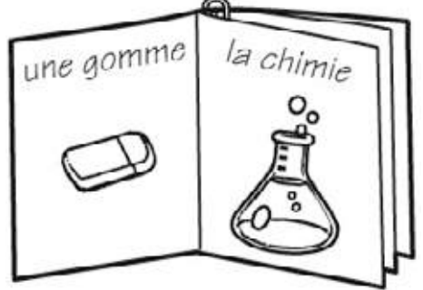
Independent Study Guide