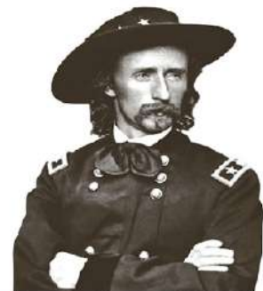
George Custer 1839–1876

In 1876 prospectors overran the Lakota Sioux reservation in the Dakota Territory to mine gold in the Black Hills. The Lakota saw no reason to abide by a treaty that settlers were violating, so many left the reservation to hunt near the Bighorn Mountains in Montana. The government responded by sending an expedition accompanied by Lieutenant Colonel George A. Custer and the Seventh Cavalry. Custer underestimated the fighting capabilities of the Lakota and the Cheyenne. On June 25, 1876, he launched an attack on one of the largest groups of Native American warriors ever assembled on the Great Plains.