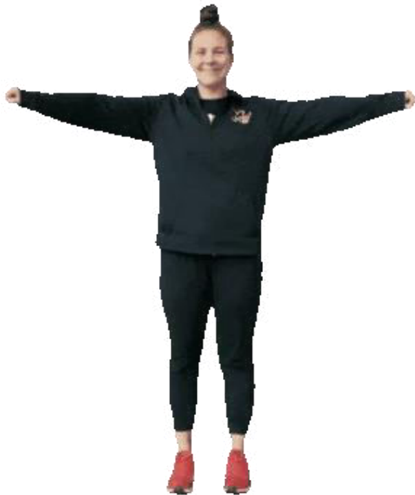
Side Arm Raises