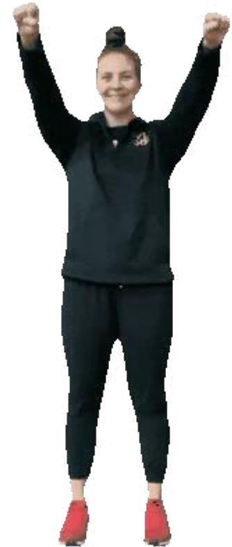
Front Arm Raises