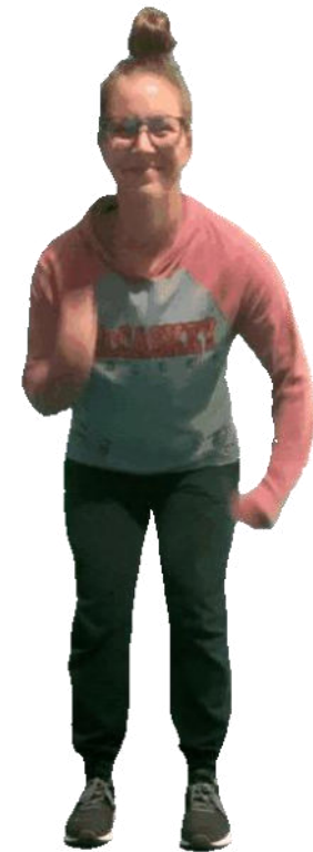
Running Arms Run in Place