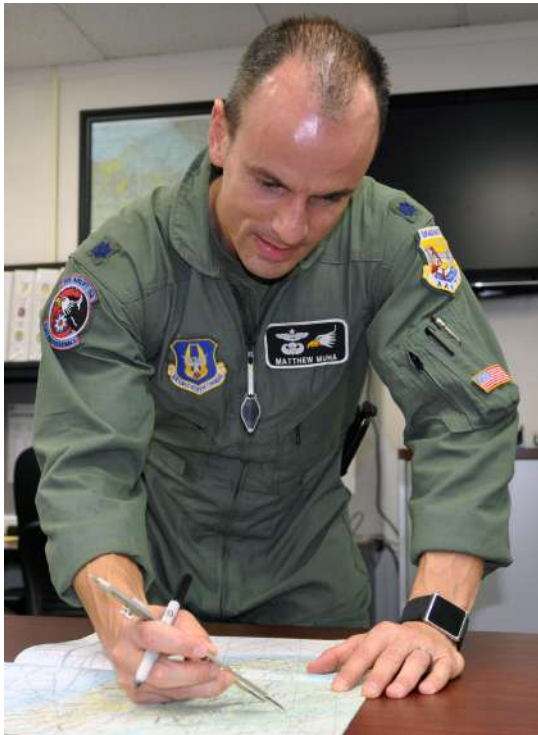
Knowledge 9 Lesson 2

(n.) a group of ships moving or working together under one leader