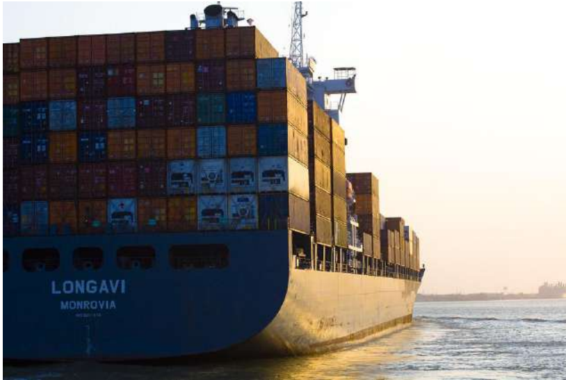
Knowledge 9 Lesson 7