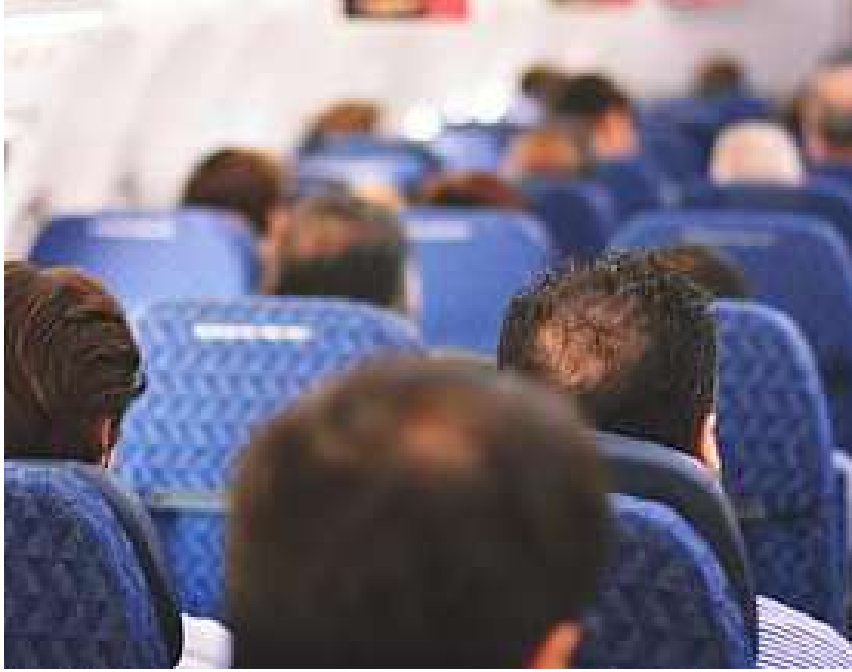
Knowledge 9 Lesson 7