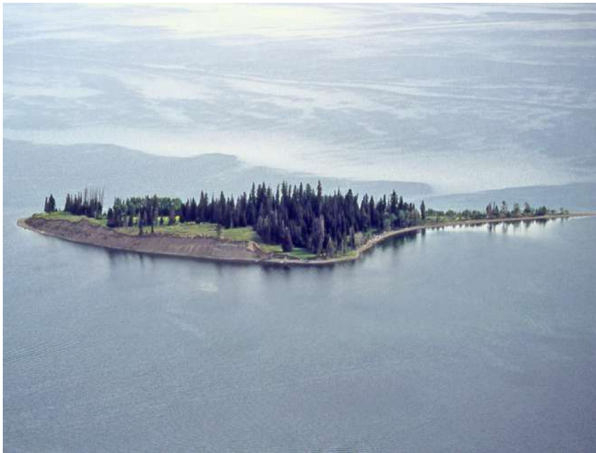
Knowledge 9 Lesson 4

(n.) someone chosen to make decisions in ruling over groups of people