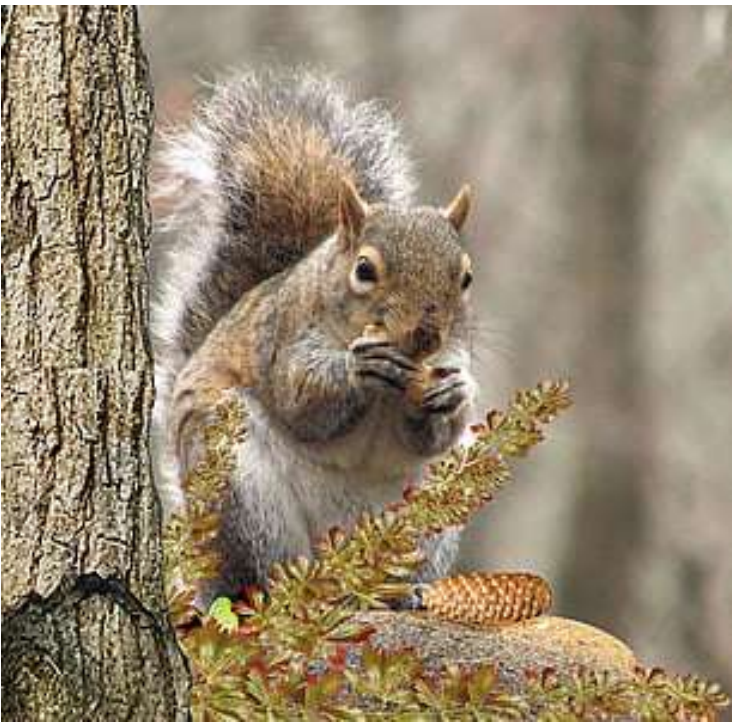
Knowledge 9 Lesson 9