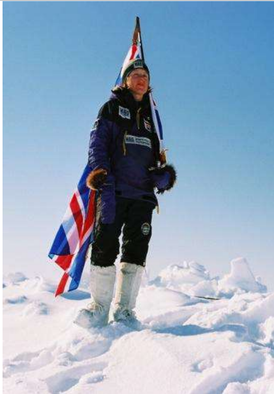
Knowledge 9 Lesson 4

(n.) leaders in charge of a country or land, like kings and queens