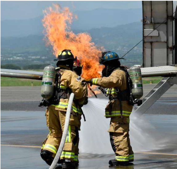
Knowledge 9 Lesson 4

(n.) the land at the edge of a body of water