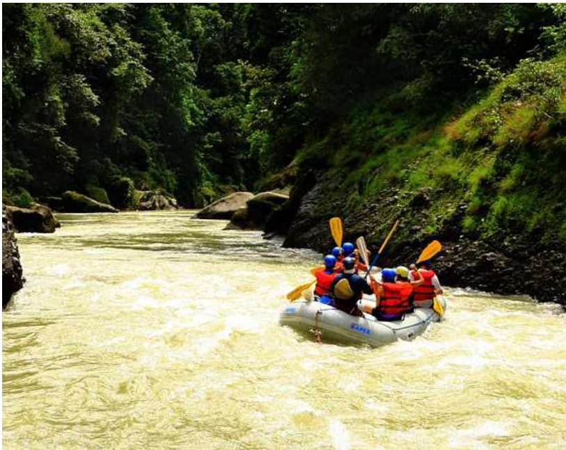
Knowledge 9 Lesson 2