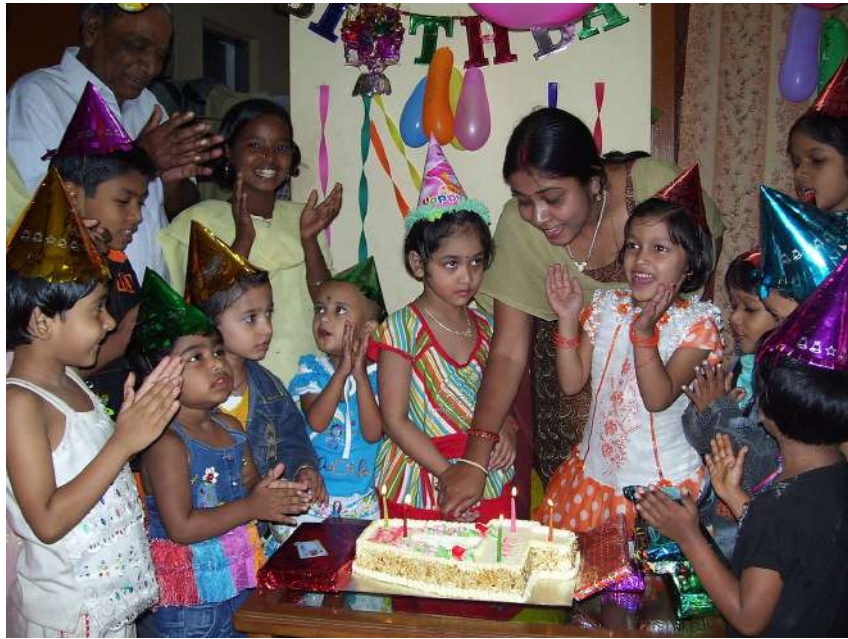
Knowledge 9 Lesson 9 Work