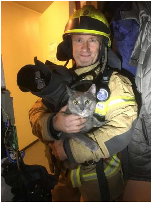
Knowledge 9 Lesson 7