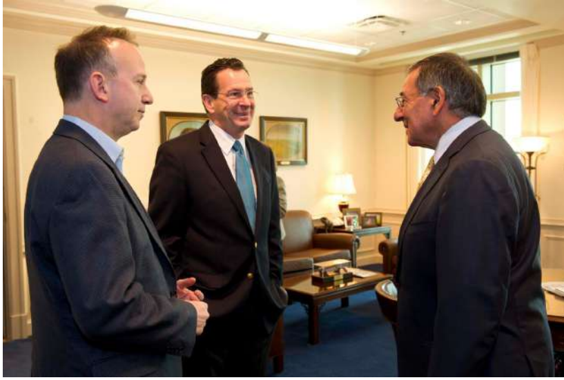
Knowledge 9 Lesson 4