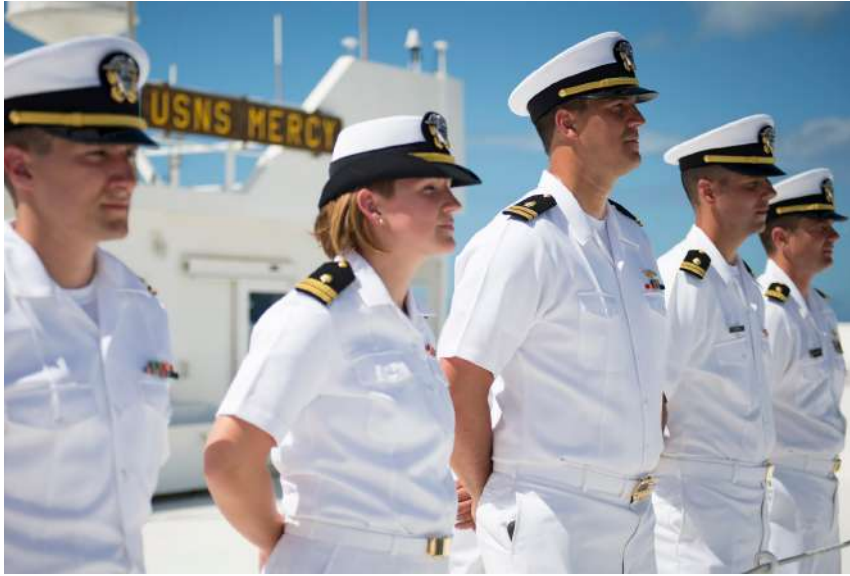
Knowledge 9 Lesson 3