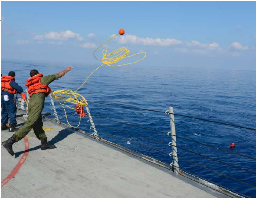
Knowledge 9 Lesson 7

(n.) a landing place; the place a person is on their way to