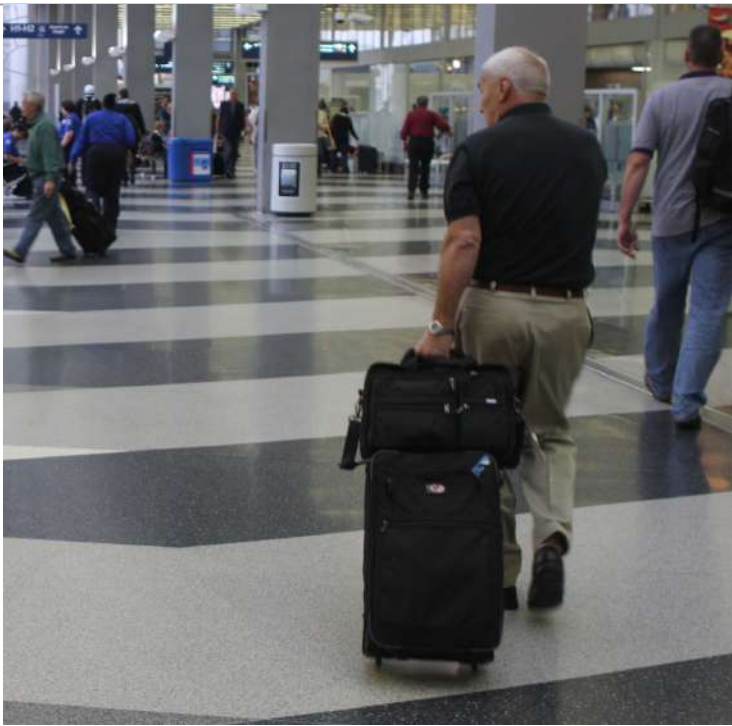
Knowledge 9 Lesson 1