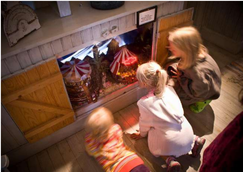
Knowledge 9 Lesson 8

(n.) praise or honor given to someone who is important or does something good