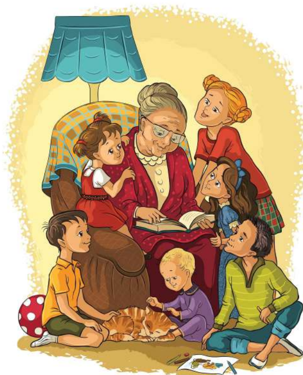
Knowledge 9 Lesson 8

(n.) a person traveling in a vehicle who is not the driver