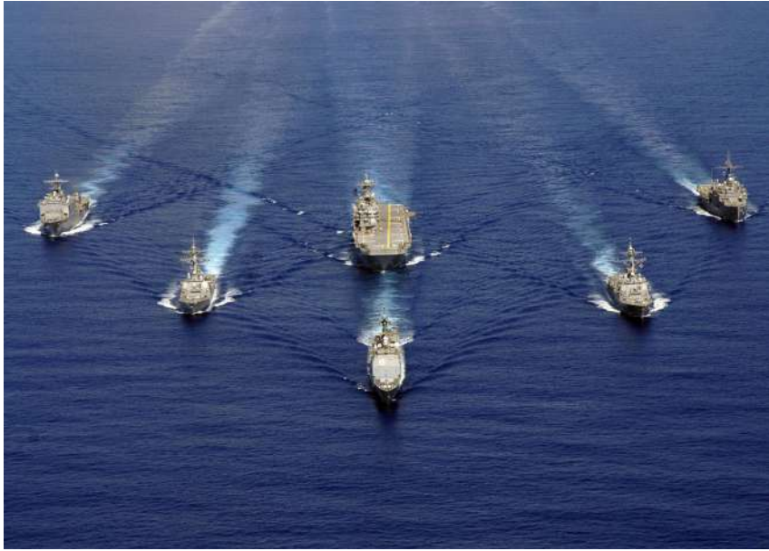
Knowledge 9 Lesson 2