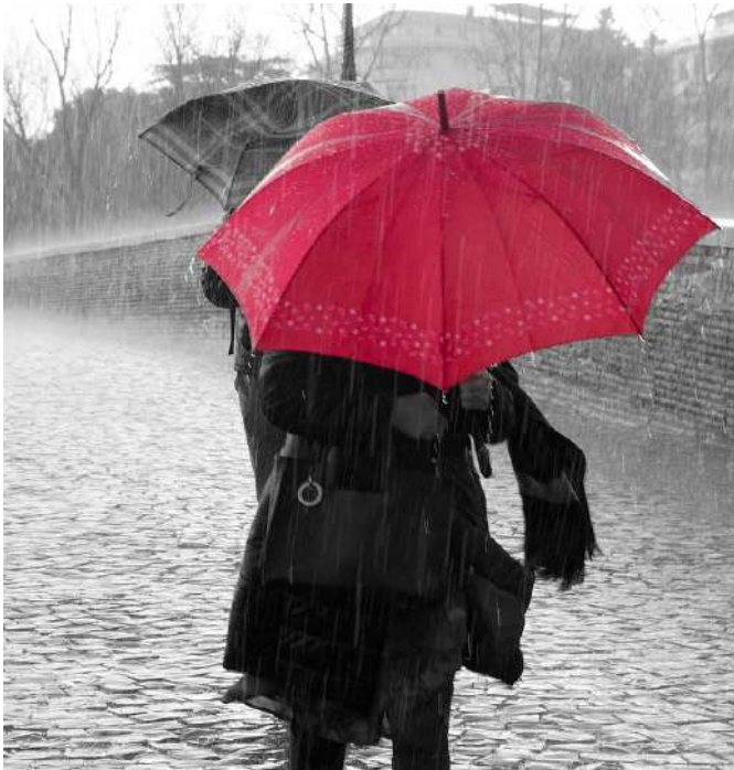
Knowledge 9 Lesson 9