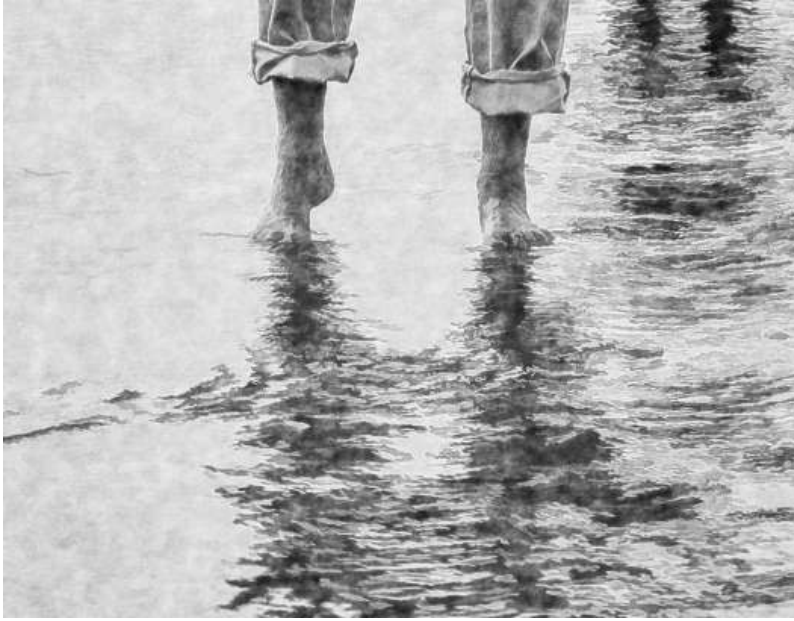
Knowledge 9 Lesson 6