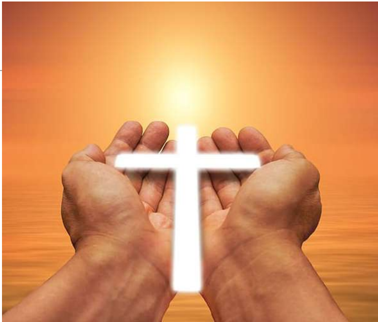
Knowledge 9 Lesson 6