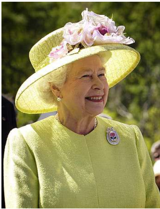
Knowledge 9 Lesson 3