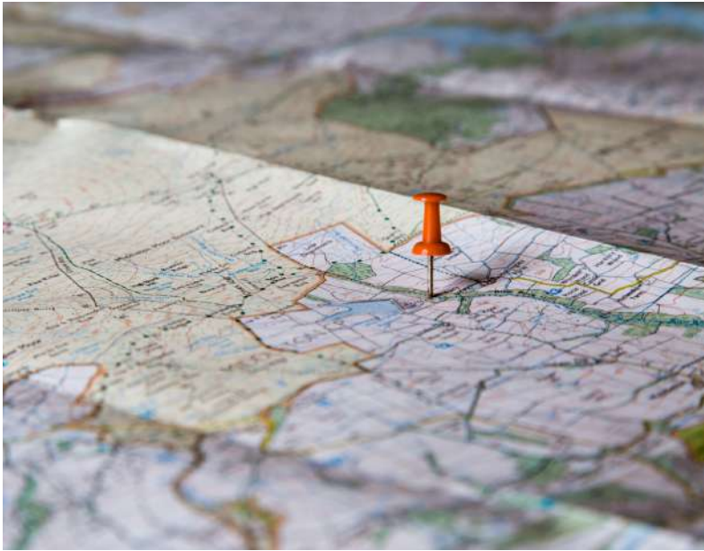
Knowledge 9 Lesson 7