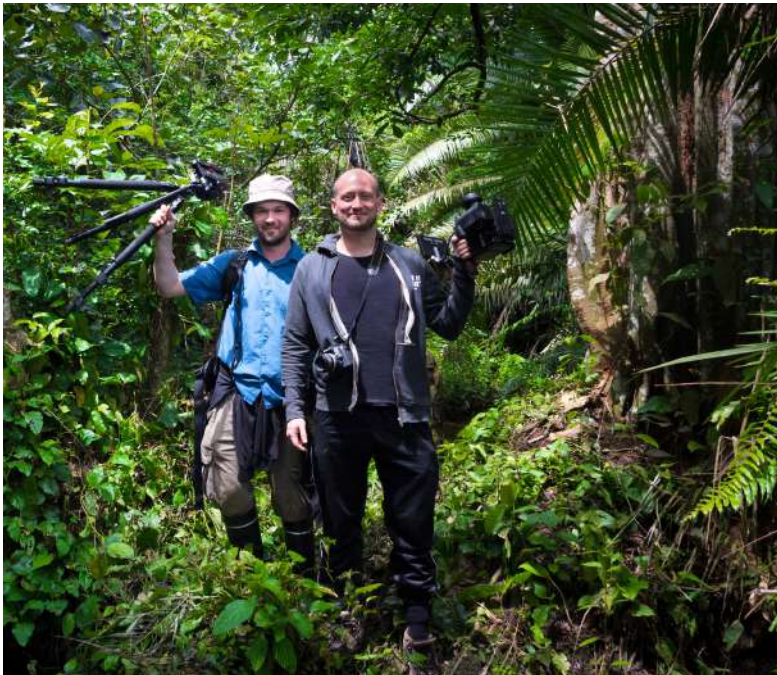
Knowledge 9 Lesson 3