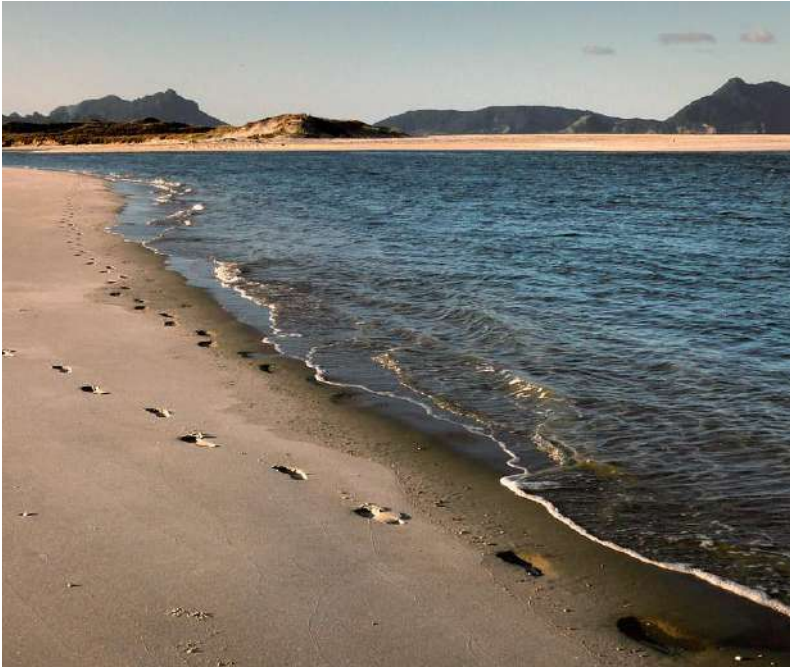
Knowledge 9 Lesson 3