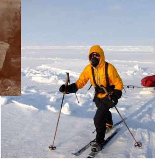
Knowledge 9 Lesson 6