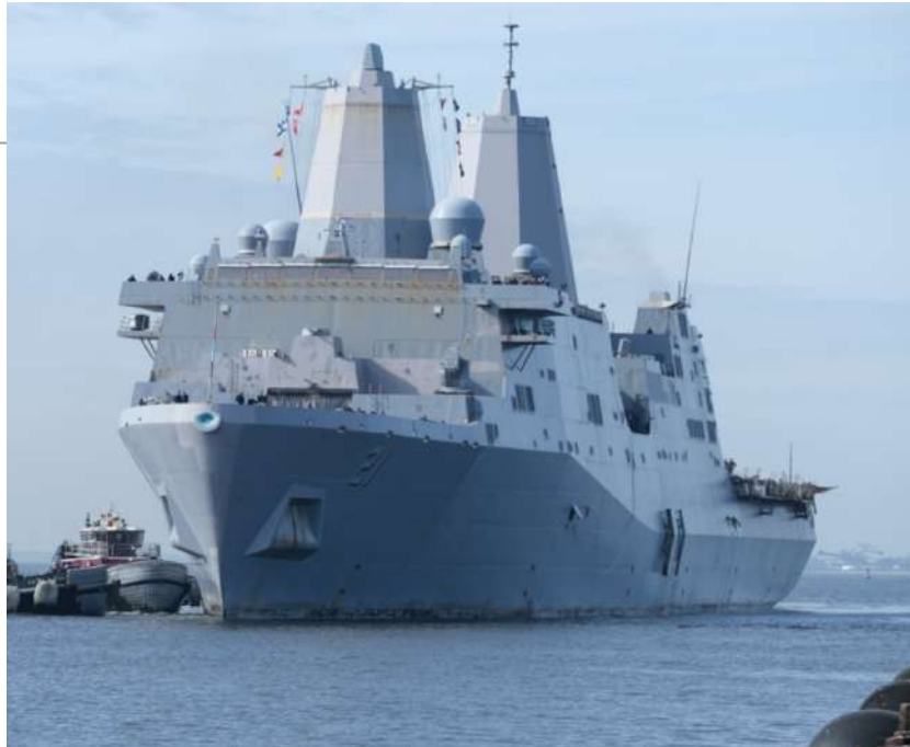
Knowledge 9 Lesson 1

(n.) a party, especially one that marks a special event