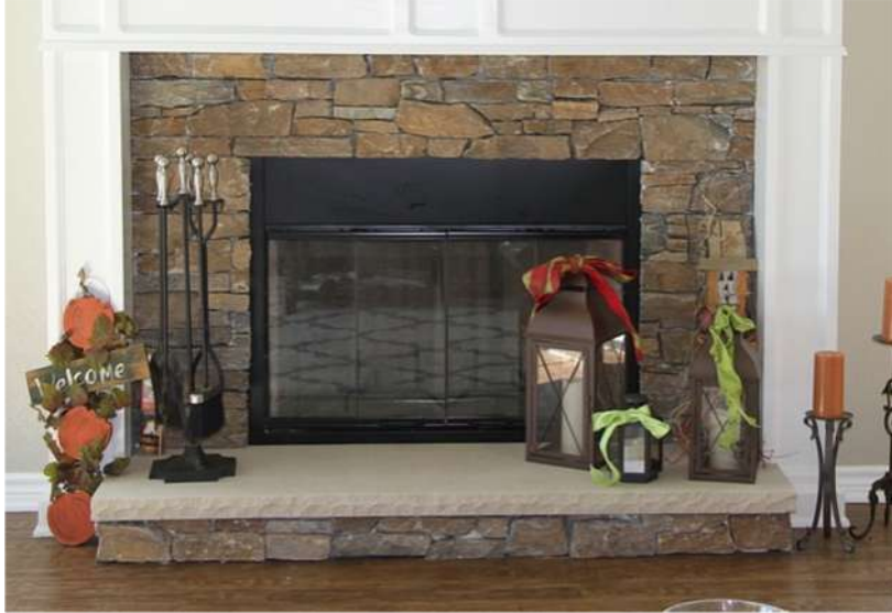
Knowledge 7 Lesson 7