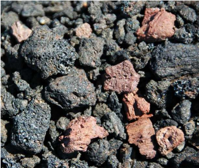
Knowledge 7 Lesson 7