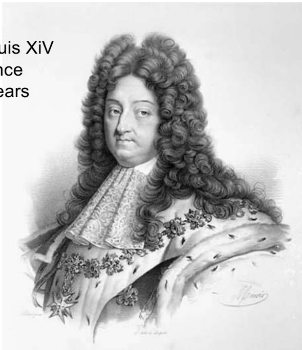
King Louis XIV France 72 years