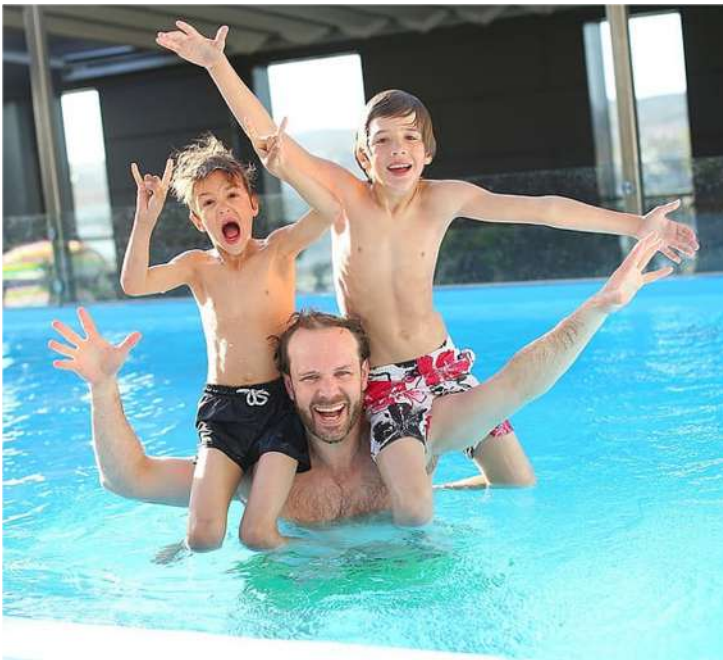
Knowledge 7 Lesson 7