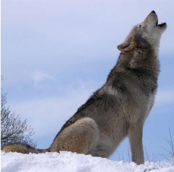
Knowledge 7 Lesson 6