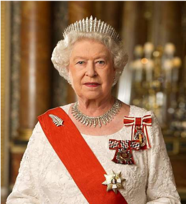
Knowledge 7 Lesson 1

(n.) an area ruled or governed by a king or queen