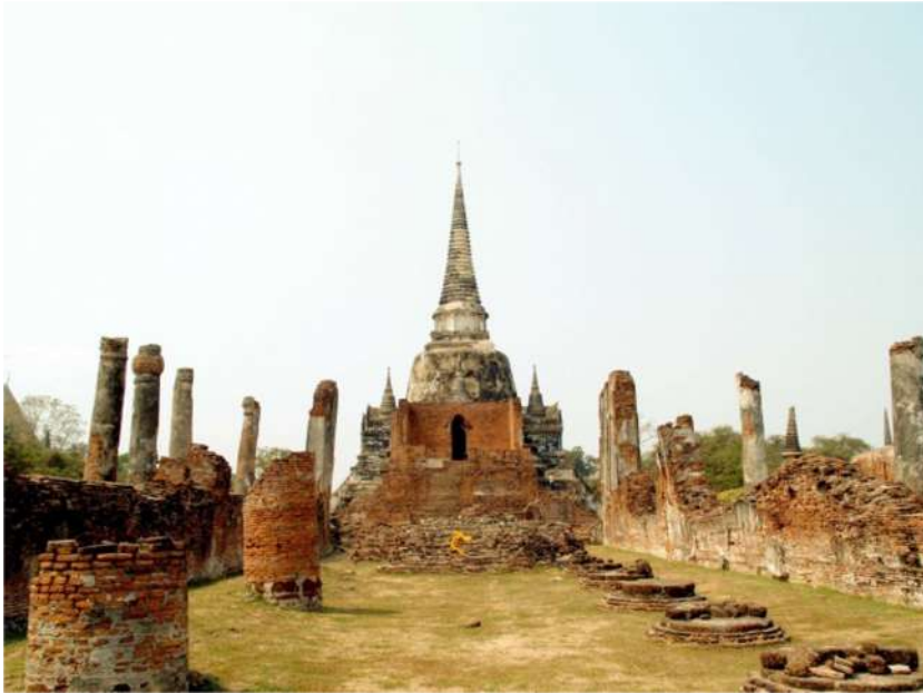
Knowledge 7 Lesson 1