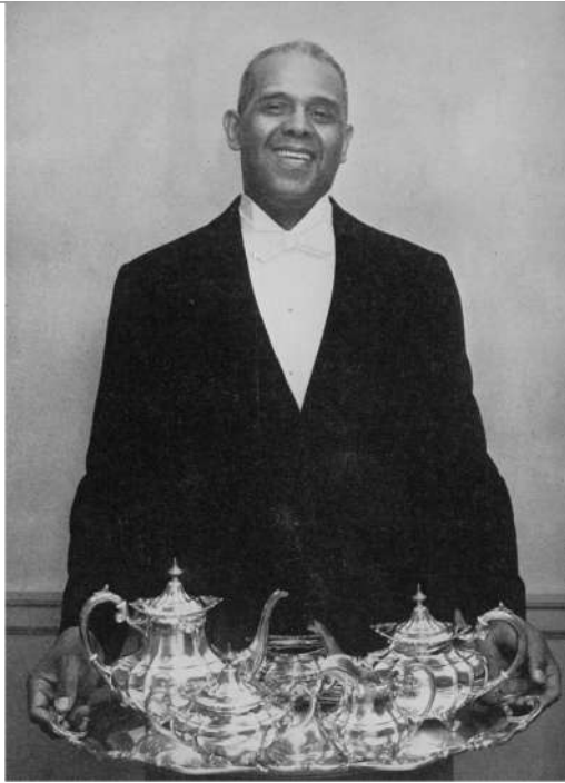
Knowledge 7 Lesson 1