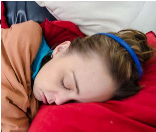
Knowledge 7 Lesson 2