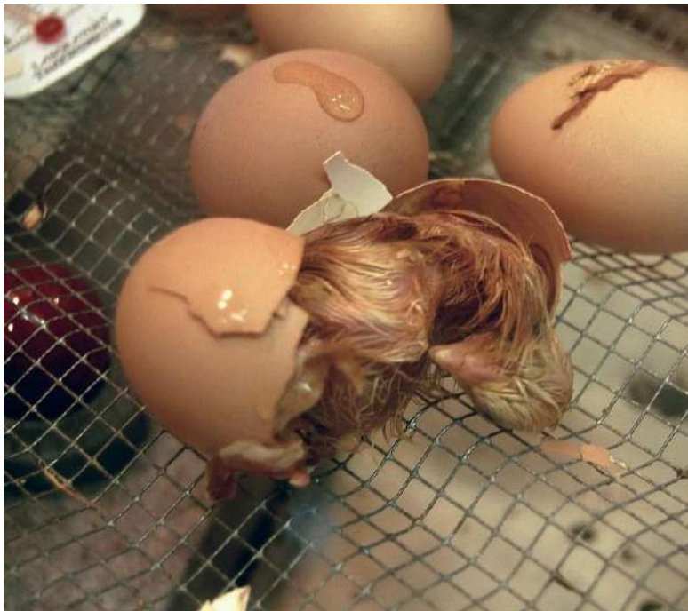
Knowledge 5 Lesson 3