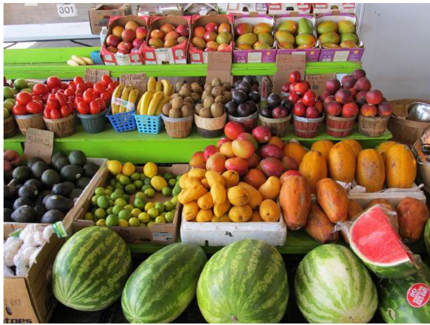
Knowledge 5 Lesson 6