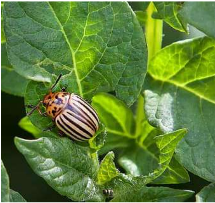
Knowledge 5 Lesson 8