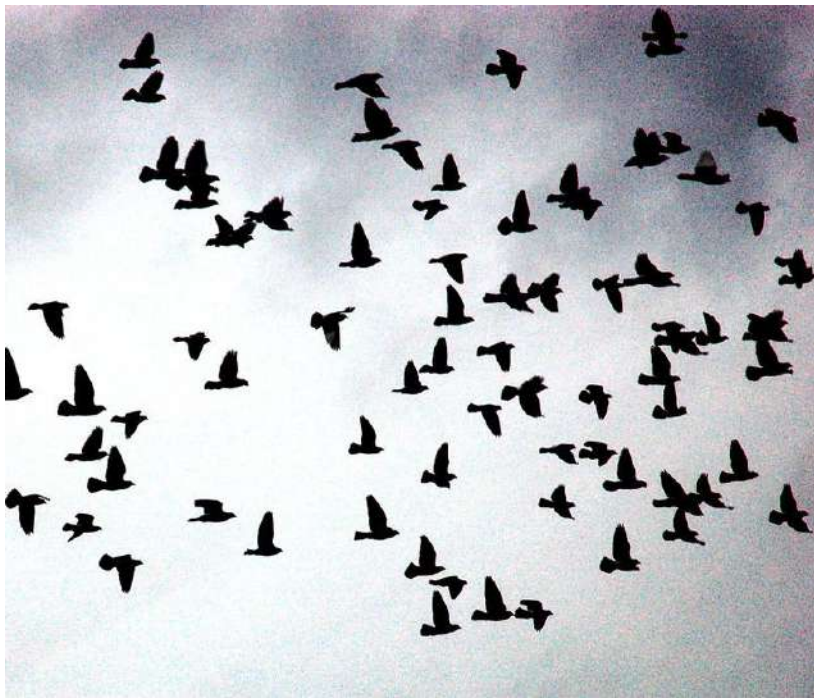
Knowledge 5 Lesson 5