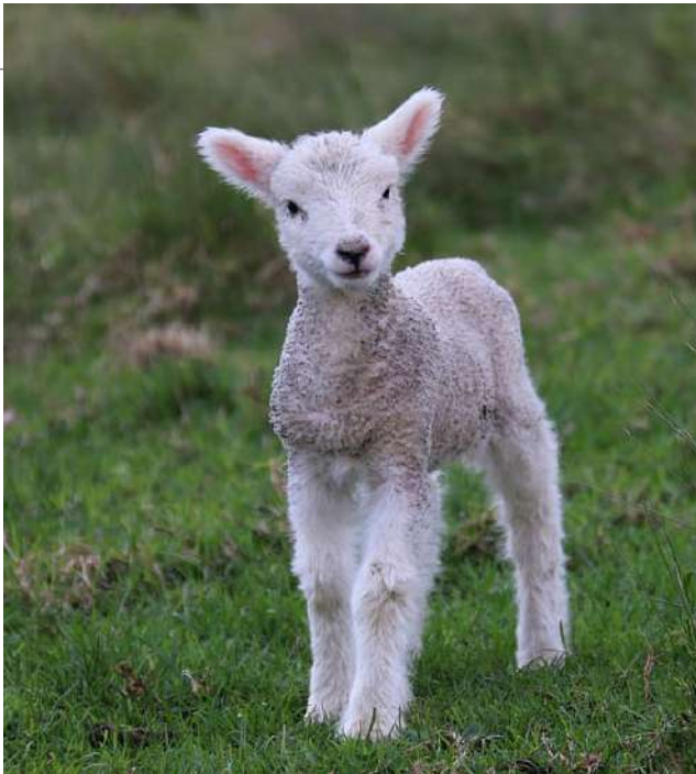
Knowledge 5 Lesson 5