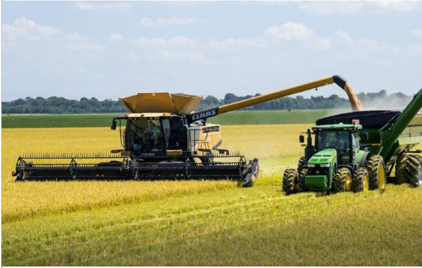
Knowledge 5 Lesson 1