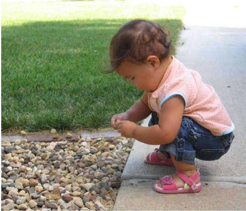
Knowledge 5 Lesson 3