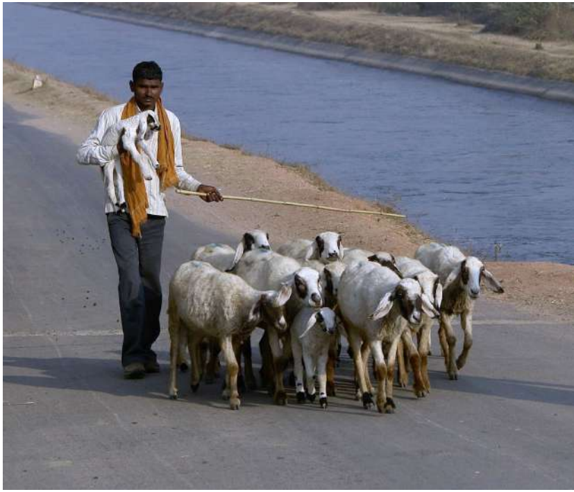
Knowledge 5 Lesson 5