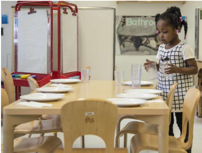
Knowledge 5 Lesson 5

(n.) a group of animals, such as sheep or birds