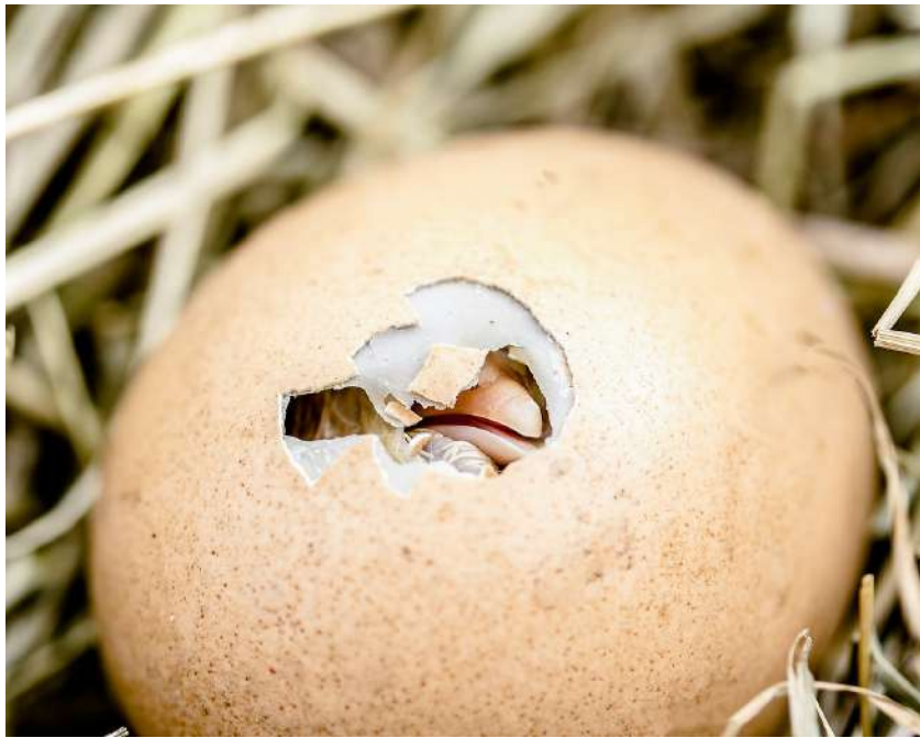
Knowledge 5 Lesson 3