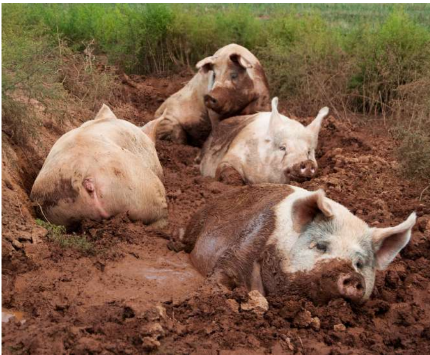
Knowledge 5 Lesson 4