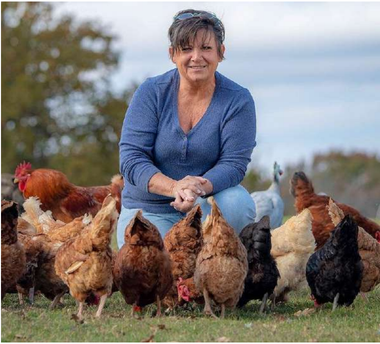
Knowledge 5 Lesson 4