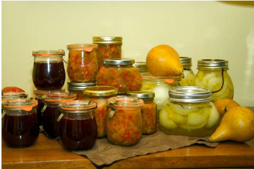
Knowledge 5 Lesson 9

(n.) animals, such as insects, that harm crops