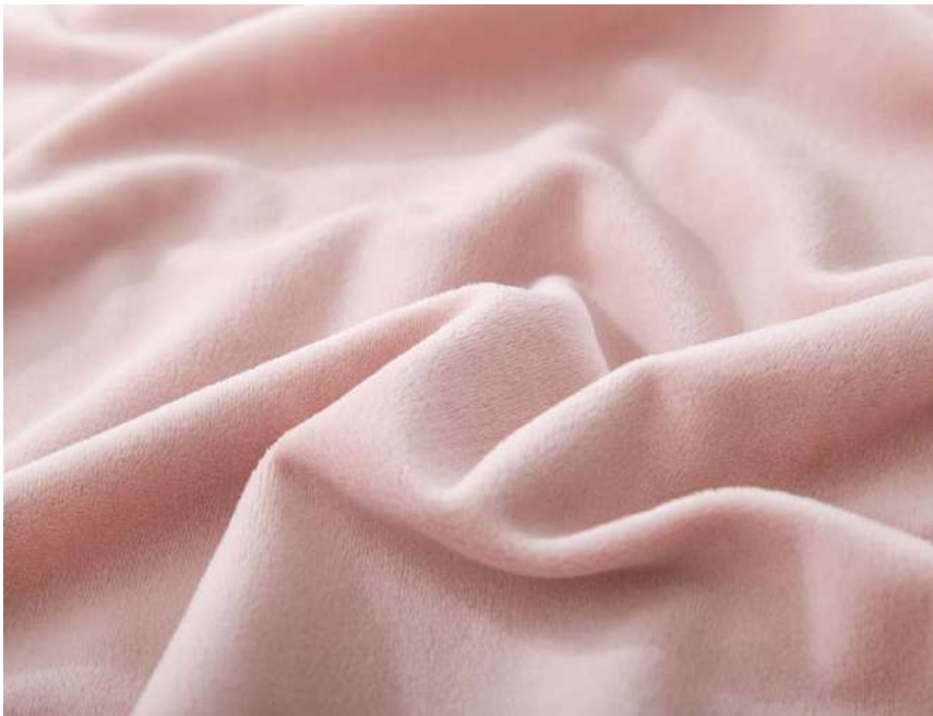
Knowledge 5 Lesson 5