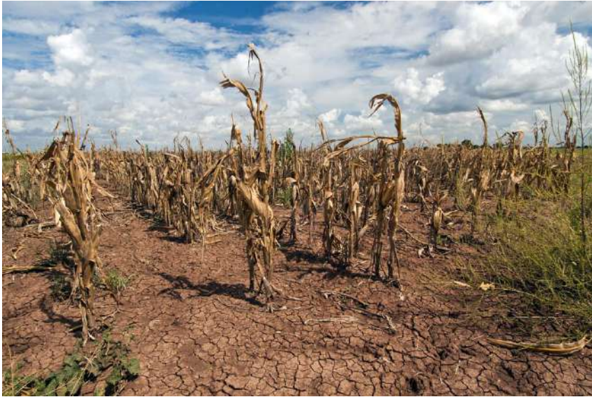
Knowledge 5 Lesson 8