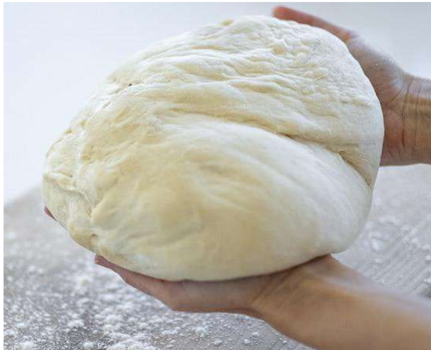
Knowledge 5 Lesson 7