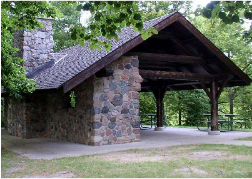
Knowledge 5 Lesson 1