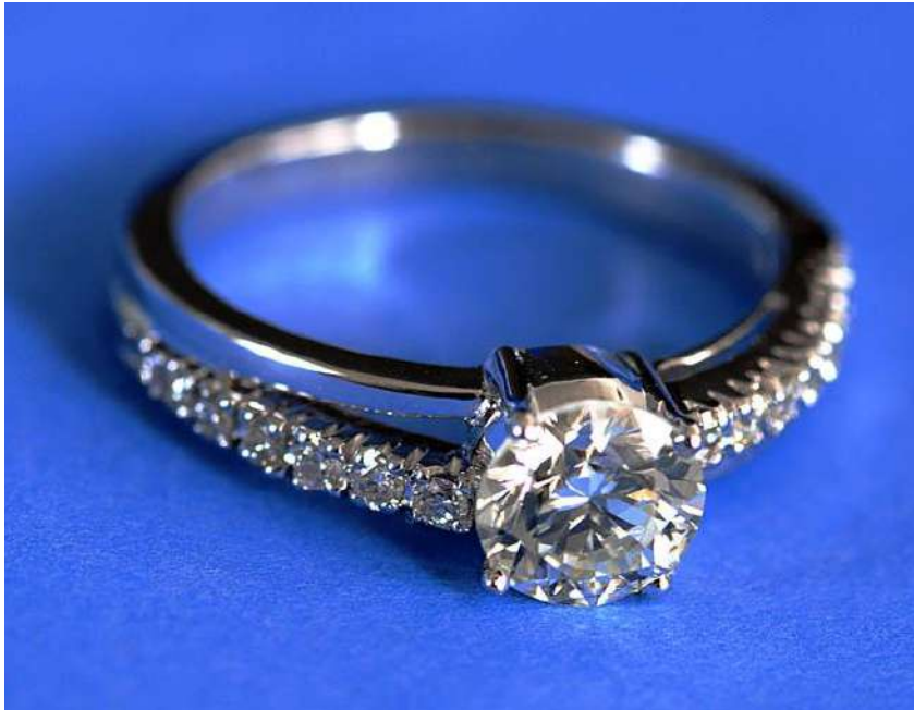
Knowledge 5 Lesson 4