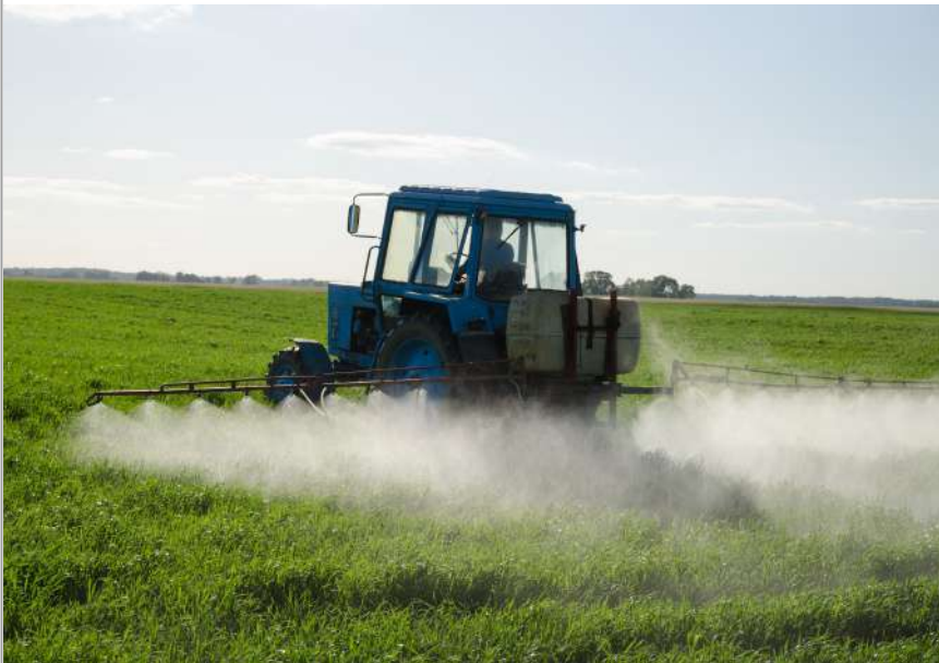
Knowledge 5 Lesson 8

(v.) to bring water to a place where crops are planted