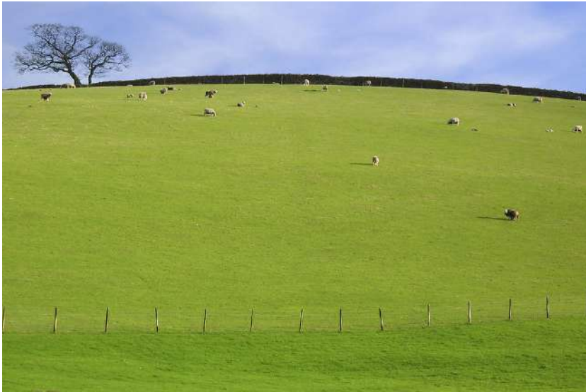
Knowledge 5 Lesson 1

(v.) to gather a crop that is ready to be used or eaten