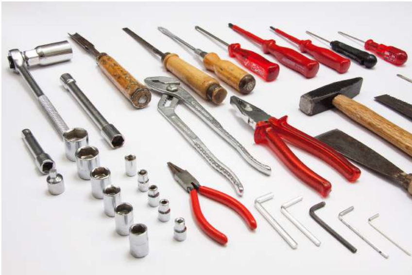
Knowledge 5 Lesson 1

(n.) a structure that protects people or animals from the weather or danger