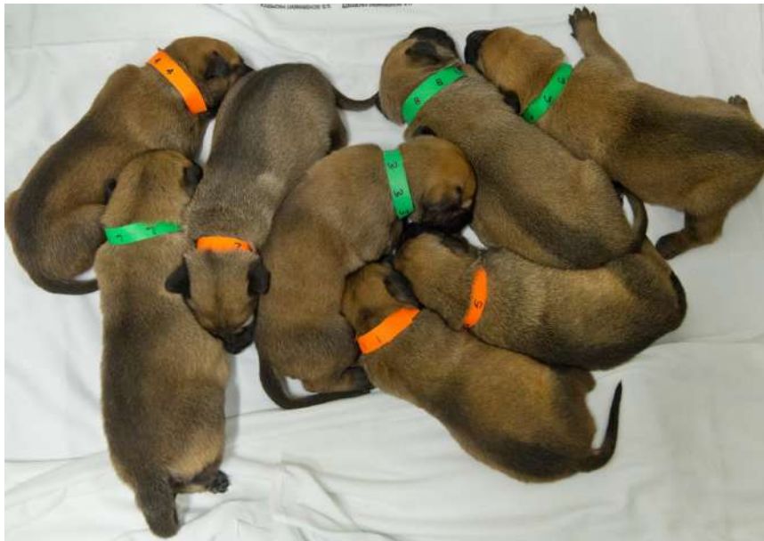
Knowledge 5 Lesson 4