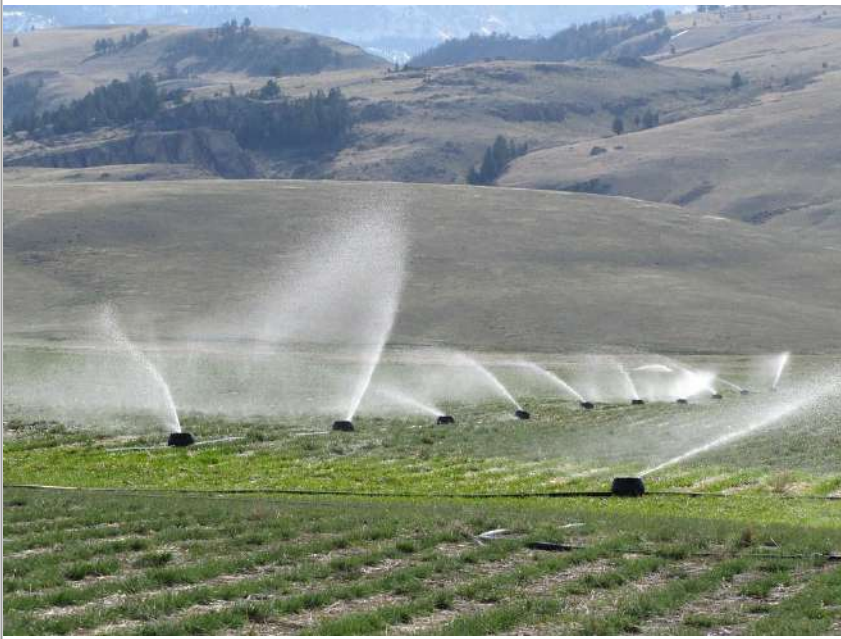
Knowledge 5 Lesson 8