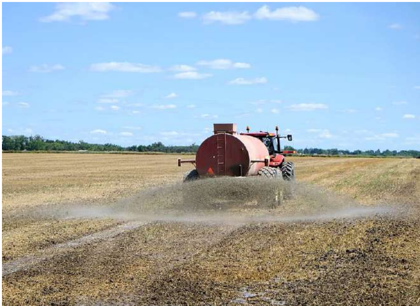
Knowledge 5 Lesson 8

(n.) a period of time when there is very little or no rain