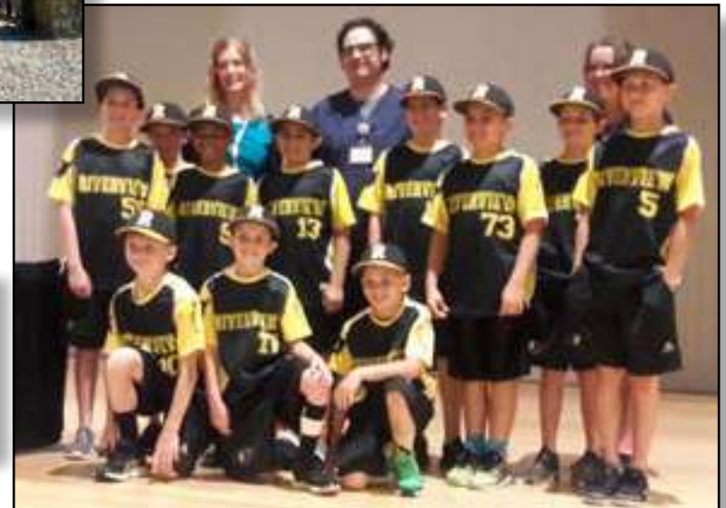
AN ENGAGED AND CARING COMMUNITY