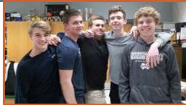
Riverview Educational Foundation