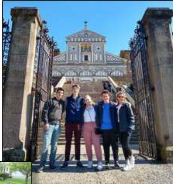
EXPANSIVE LEARNING OPPORTUNITIES