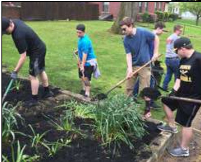
SMALL NEIGHBORHOOD SCHOOLS