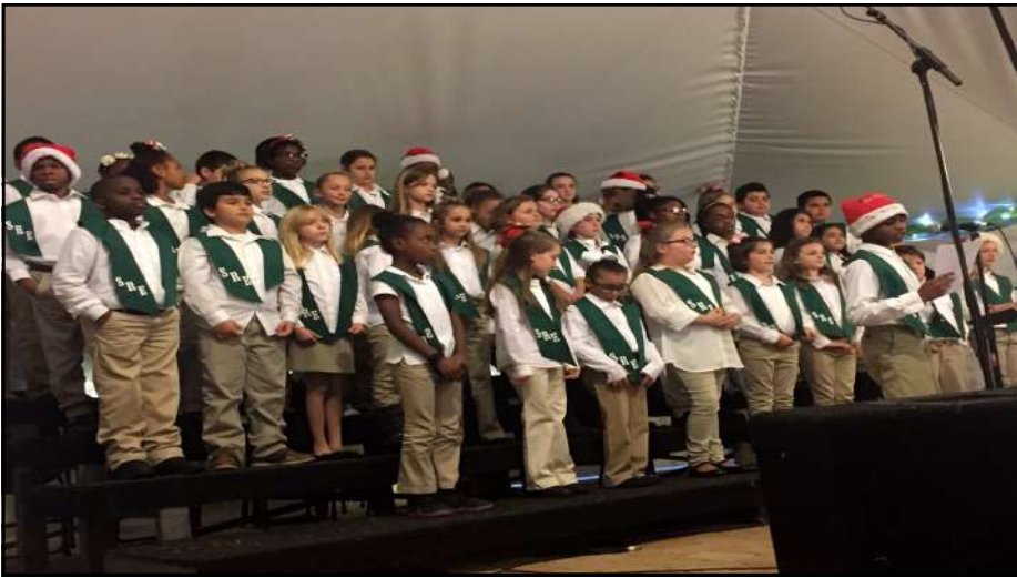
Our SRE Choir performed at Celebration in the Oaks in City Park last month.