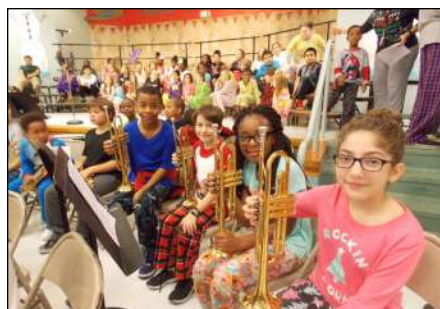
Band and choir members performed at our Community Morning Meeting last month. The performance was enjoyed by all !