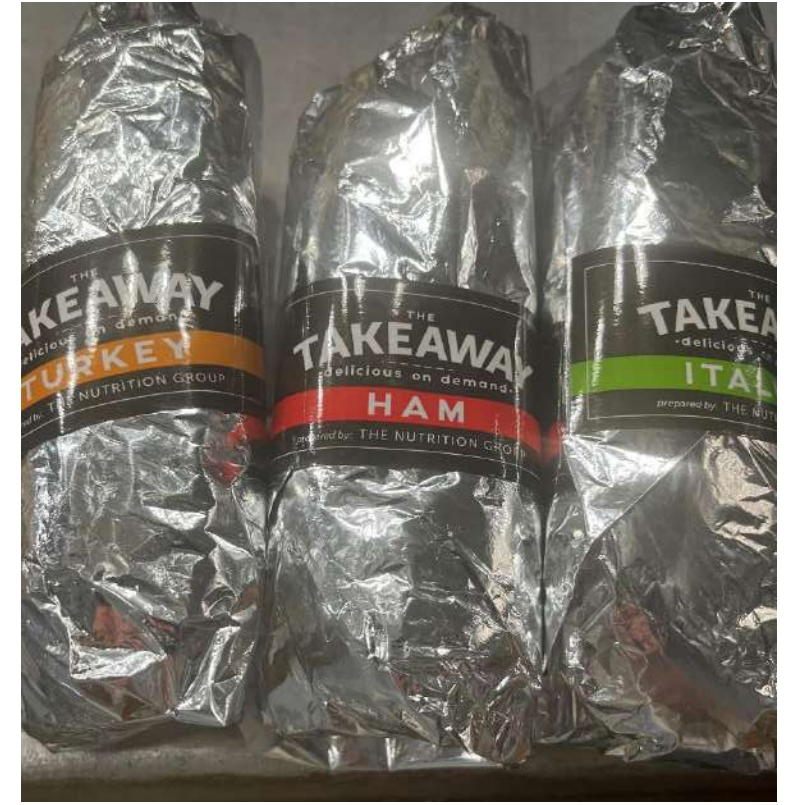
Freshly Made Wraps