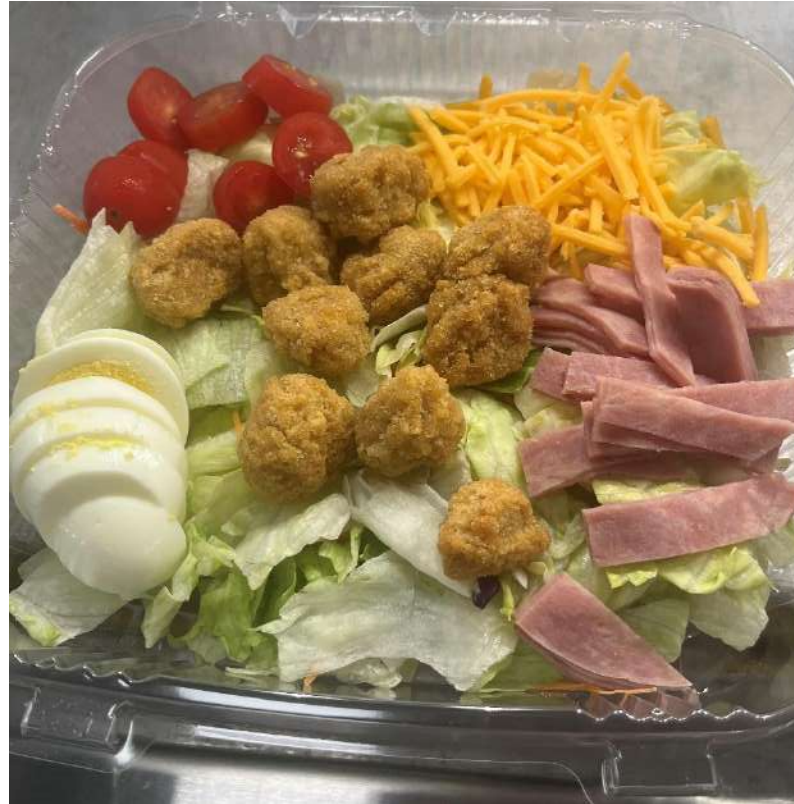
Chef Salad with Popcorn Chicken