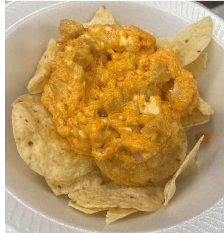
Buffalo Chicken Dip With Tortilla Chips

Breakfast and lunch sales were slightly under budget in May, but ala carte sales remain over budget.