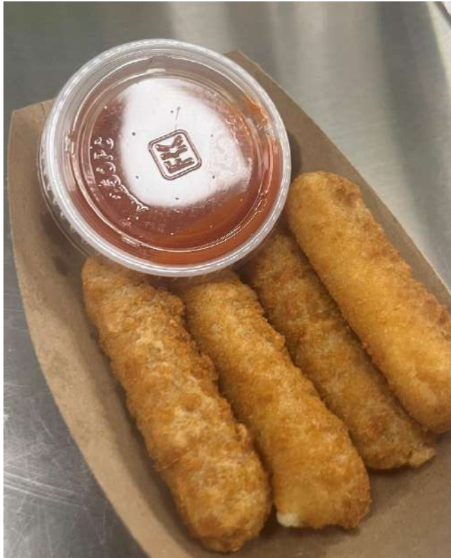
Mozzarella Sticks with Marinara