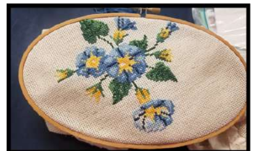
Cross stitching (Alexis Hakes)